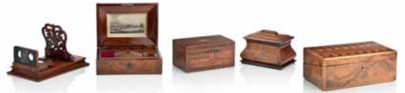
363 A 19TH CENTURY MAHOGANY JEWELLERY BOX The lid interior inset with a print of St. Petersburg, together with another example probably converted from a tea caddy, a Scottish sarcophagus shaped tea caddy, a Victorian mahogany folding magnifier viewer and a 19th century walnut and parquetry inlaid writing box, 30cm wide, 22cm deep, 11cm high (11 1/2in wide, 8 1/2in deep, 4in high). (5) £500 - 700 €550 - 760