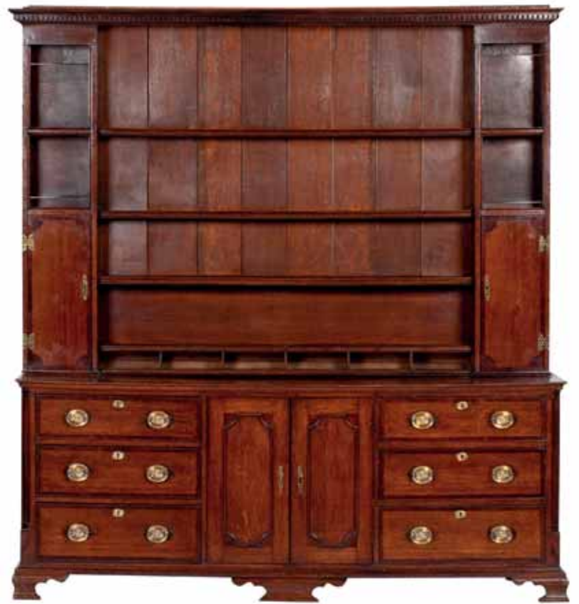
293 A 19TH CENTURY OAK AND MAHOGANY CROSSBANDED WELSH DRESSER With moulded cornice above a plate rack fitted with two cupboard doors, the base fitted with a pair of cupboard doors and six graduated drawers, raised on bracket feet, 217cm wide, 54cm deep, 234cm high (85in wide, 21in deep, 92in high). £400 - 600 €440 - 660