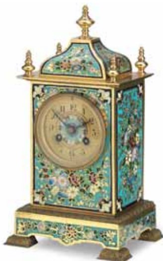
442 A LATE 19TH CENTURY CHAMPLEVE ENAMEL BRASS MANTEL CLOCK Inscribed 'Edward and Sons, Glasgow, Paris Made' The 3in. dial with Arabic numerals, the twin train movement stamped 'Vincent & Cie', contained in a case raised on a moulded base with acanthus moulded bracket feet, 15cm wide, 11cm deep, 30cm high, (5 1/2in wide, 4 in deep, 11 1/2in high) £400 - 600 €440 - 660