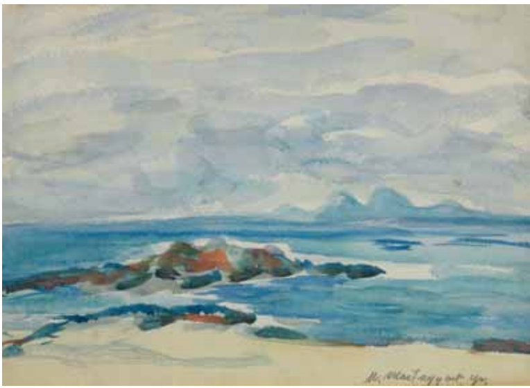
231 SIR WILLIAM MACTAGGART PPRSA RA FRSE HONRSW LLD (SCOTTISH, 1903-AR 1981)

The Paps of Jura signed lower right, watercolour 23 x 32cm (9 1/16 x 12 5/8in). £700 - 1,000 €760 - 1,100