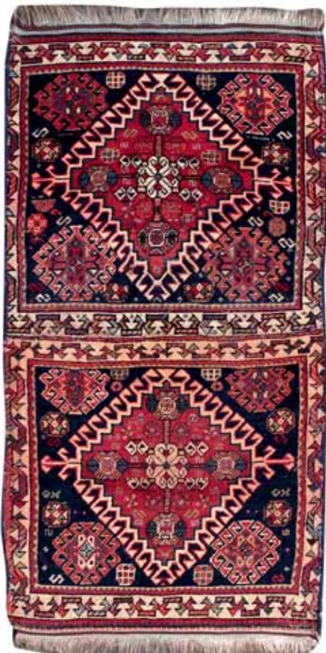
422 A PAIR OF KASHAG BAG FACES South West Persia, 99cm x 53cm £200 - 300 €220 - 330

See https://www.bonhams.com/ for further footnote on this lot