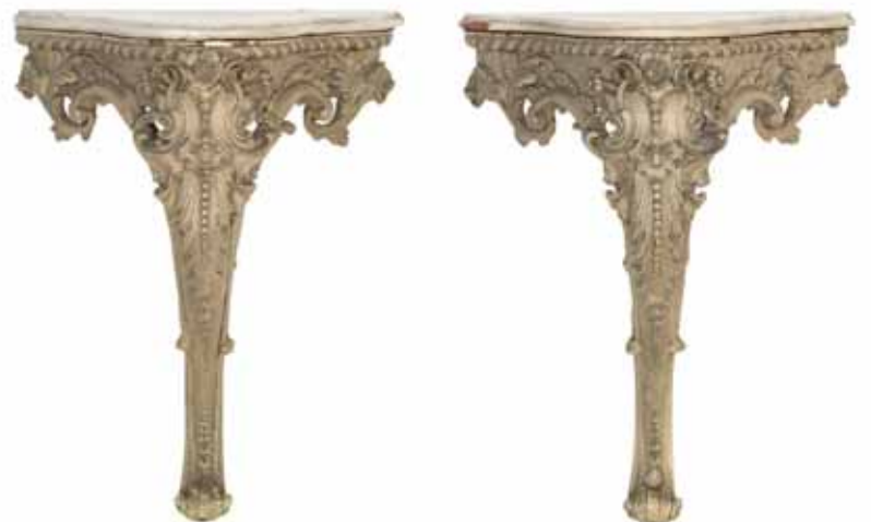
305 A PAIR OF SMALL 19TH CENTURY ROCOCO REVIVAL PAINTED PIER TABLES the loose serpentine white marble tops above elaborately carved and decorated single cabriole pedestal bases, 52cm wide x 30cm deep x 68cm high, (20in wide x 11 1/2in deep x 26 1/2in high) (2) £600 - 800 €660 - 870