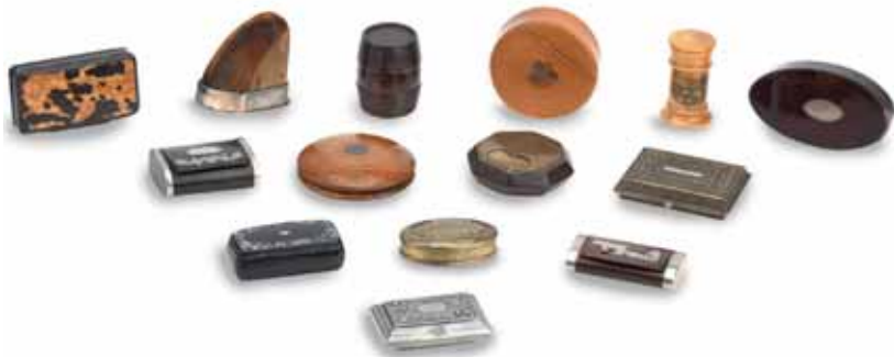
387 A LARGE COLLECTION OF 19TH/EARLY 20TH CENTURY SNUFF MULLS AND BOXES (For full description please visit www.bonhams.com ) £500 - 700 €550 - 760

See https://www.bonhams.com/ for further footnote on this lot