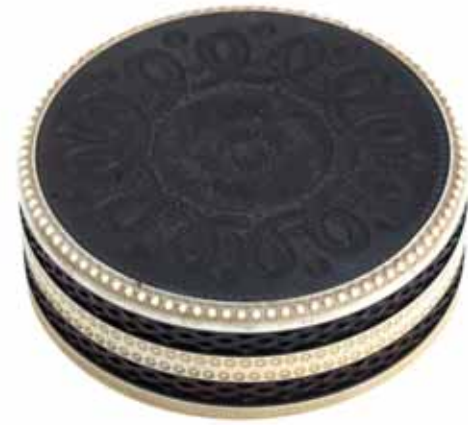
269 AN EARLY 19TH CENTURY EBONY AND IVORY PATCH BOX Y Of circular form, carved with concentric designs, 10cm diameter, 4cm high (3 1/2in diameter, 1 1/2in high) Φ £400 - 600 €440 - 660