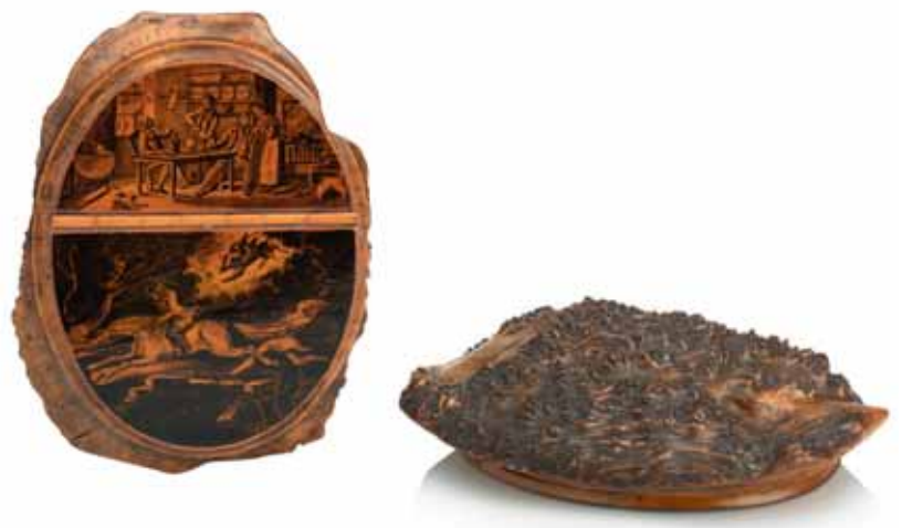
379 A LARGE SCOTTISH REGENCY ROOT WOOD AND PENWORK WOODEN SNUFF BOX Decorated with a scene from Tam O'Shanter, 15cm wide, 21cm deep, 6cm high (5 1/2in wide, 8in deep, 2in high) £500 - 700 €550 - 760