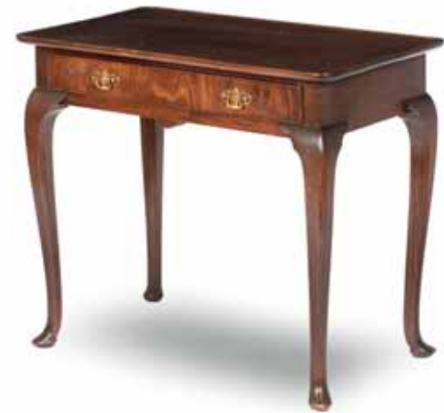
271 A MID 20TH CENTURY MAHOGANY SIDE TABLE stamped Whytock & Reid, Edinburgh, With rectangular dished top above a single frieze drawer, raised on cabriole legs with pointed toes, 85cm wide, 51cm deep, 75cm high (33in wide, 20in deep, 29 1/2in high). £300 - 500 €330 - 550