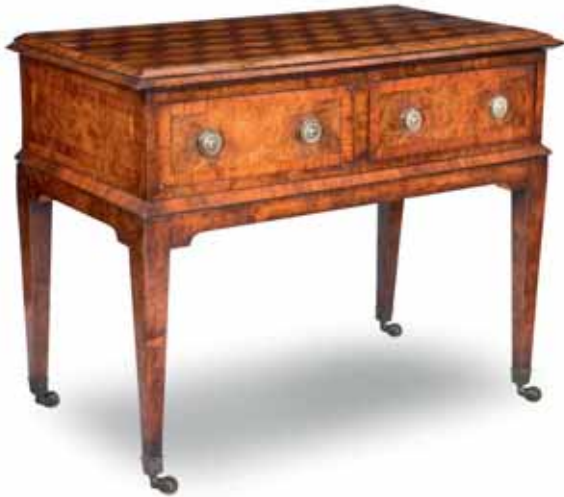
264 A LATE 18TH CENTURY DUTCH PARQUETRY WALNUT, BURR WALNUT AND Y ROSEWOOD SIDE TABLE The rectangular moulded top above two short drawers, raised on square tapered legs with brass caps and castors, 111cm wide, 58cm deep, 88cm high (43 1/2in wide, 22 1/2in deep, 34 1/2in high). £800 - 1,200 €870 - 1,300