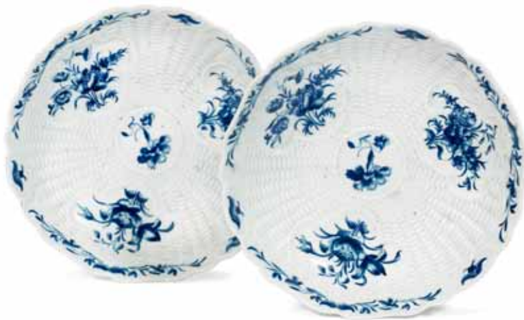
66 A PAIR OF WORCESTER JUNKET DISHES Circa 1765 Of circular form and painted in blue with the 'Junket Dish Florals' pattern, leafy stems painted below the rims, 22.5cm diameter, crescent marks (2) £400 - 600 €440 - 660