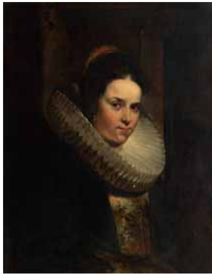
251 BRITISH SCHOOL (19TH CENTURY) Lady in a Ruff Collar oil on canvas, 75.5 x 64cm (29 3/4 x 25 3/16in). £400 - 600 €440 - 660