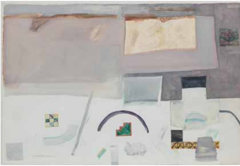
207 DAME ELIZABETH BLACKADDER OBE RA RSA RSW RGI DLITT (BRITISH, BORN 1931) AR Still Life in White and Grey signed and dated 1972, watercolour, 69 x 103 cm. (27 3/16 x 40 9/16 in.) £2,000 - 3,000 €2,200 - 3,300

See https://www.bonhams.com/ for further footnote on this lot