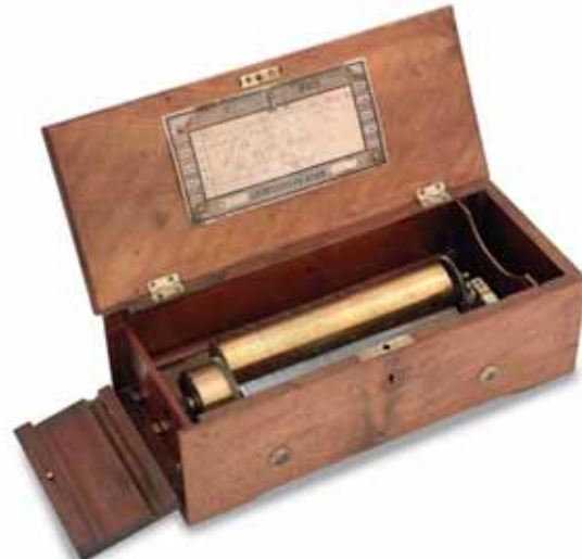
457 A 19TH CENTURY WALNUT AND MARQUETRY INLAID CYLINDER MUSIC BOX Probably by Bremond, stamped No. 13322 With 20cm cylinder playing six airs, as per paper label, contained within a rectangular case, 37cm wide, 16cm deep, 12cm high (14 1/2 in wide, 6 in deep, 4 1/2 in high) £600 - 900 €660 - 980