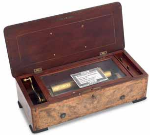
449 A 19TH CENTURY BURR WALNUT AND INLAID CYLINDER MUSIC BOX Bearing paper label inscribed Nicole Freres, musique De Geneve No. 46014 With 23cm cylinder playing four airs, as per paper label, contained within a rectangular case, 46cm wide, 20cm deep, 14cm high (18in wide, 7 1/2in deep, 5 1/2in high) £600 - 900 €660 - 980