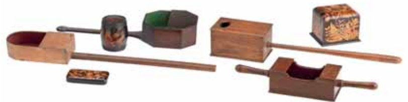
385 A 19TH CENTURY MAUCHLINE WARE FERNWARE TEA CADDY The lid centred with an image of Dunkeld Cathedral, the interior with a single lidded compartment, stamped 'Wilson & Amphlet Mauchline' with Royal warrant above, raised on a plinth, together with a 19th century Fernware barrel shaped tea caddy, a 19th century Fernware cigar case and four church collection boxes, 15cm wide, 13cm deep, 12cm high (5 1/2in wide, 5in deep, 4 1/2in high) (7) £400 - 600 €440 - 660

See https://www.bonhams.com/ for further footnote on this lot