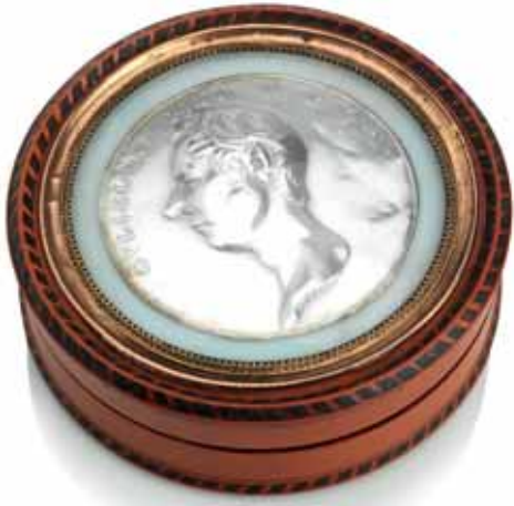
262 A 19TH CENTURY PAINTED PAPIER MÂCHÉ WILLIAM PITT THE YOUNGER Y COMMEMORATIVE SNUFF BOX The glazed lid enclosing a silver plaque embossed 'Gulielmo Pitt R.P.Q.B', 8cm diameter 2.6cm high, (3in diameter, 1in high) £250 - 350 €270 - 380