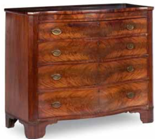
273 A SCOTTISH GEORGE III MAHOGANY SERPENTINE CHEST OF DRAWERS The four graduated drawers set within slightly canted angles, raised on bracket feet, 127cm wide, 53cm deep, 109cm high (50in wide, 20 1/2in deep, 42 1/2in high). £500 - 700 €550 - 760