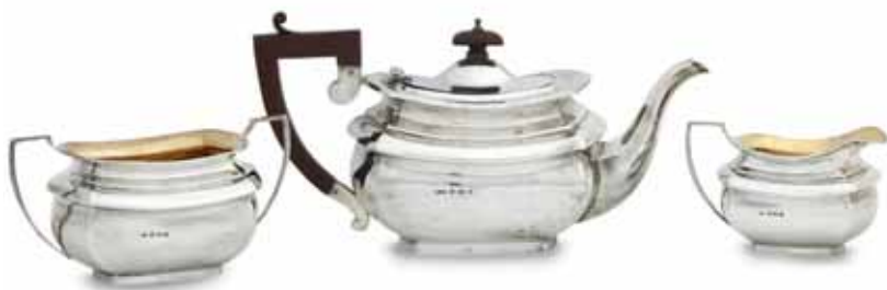
184 A THREE PIECE SILVER TEA SERVICE by H.C.Davis, Birmingham 1929 Of rounded rectangular form, the teapot with wooden handle and finial, and a miniature trophy cup and cover, with inscription for 1928, weight 40oz gross. £300 - 400 €330 - 440

See https://www.bonhams.com/ for further footnote on this lot