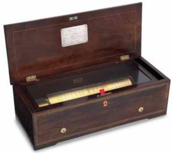
445 A 19TH CENTURY ROSEWOOD, BRASS AND TORTOISESHELL INLAID CYLINDER MUSIC BOX, Stamped Nicole Freres, No 36293, 32cm cylinder, two piece comb, playing four airs, as per silvered engraved tablet, 55cm wide, 22cm deep, 18cm high (21 1/2in wide, 8 1/2in deep, 7in high) £4,000 - 6,000 €4,400 - 6,500