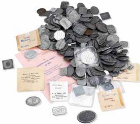
382 A LARGE COLLECTION OF 19TH CENTURY ASSORTED SCOTTISH CHURCH TOKENS Of various shapes, (qty) £400 - 600 €440 - 660