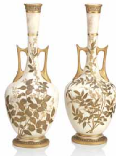
78 A PAIR OF ROYAL WORCESTER TWIN-HANDLED VASES Dated 1884 Decorated with sprays of gilt foliage on an ivory ground, 39.5cm high, printed green factory marks and impressed shape code 850 (2) £300 - 400 €330 - 440