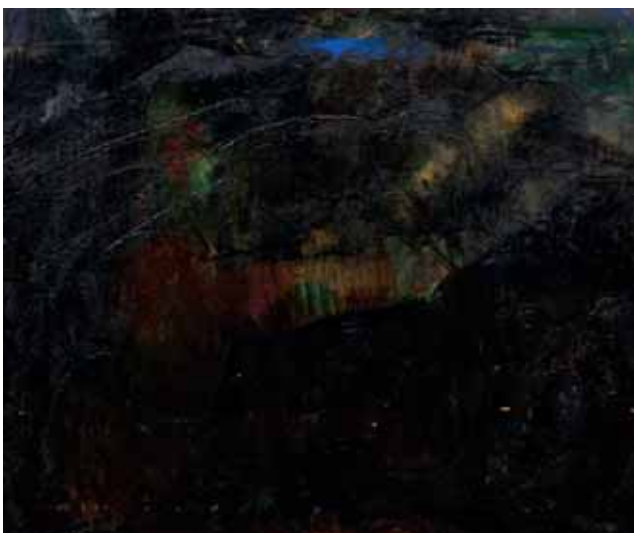
247 WILLIAM JOHNSTONE OBE (BRITISH, 1897-1981) AR Borders Landscape initialled and dated '1943' (verso), oil on board, 63.5 x 76 cm (25 x 29 15/16 in.) unframed £1,000 - 1,500 €1,100 - 1,600