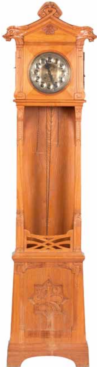
450 A LATE 19TH CENTURY ART NOUVEAU STYLE OAK LONG CASE CLOCK The 10in. circular dial with Arabic numerals, the twin weight driven movement striking a gong, contained within a case with carved details, 53cm wide, 26cm deep, 236cm high, (20 1/2 in wide, 10in deep, 92 1/2in high) £200 - 300 €220 - 330