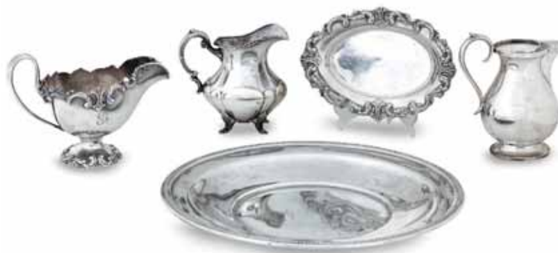
144 A SMALL GROUP OF AMERICAN SILVER various makers and dates To include a sauce boat on stand with scroll borders, by Shreve & Co , a baluster jug, with indistinct inscription, a platter and two further jugs, weight 55oz. (6) £500 - 700 €550 - 760