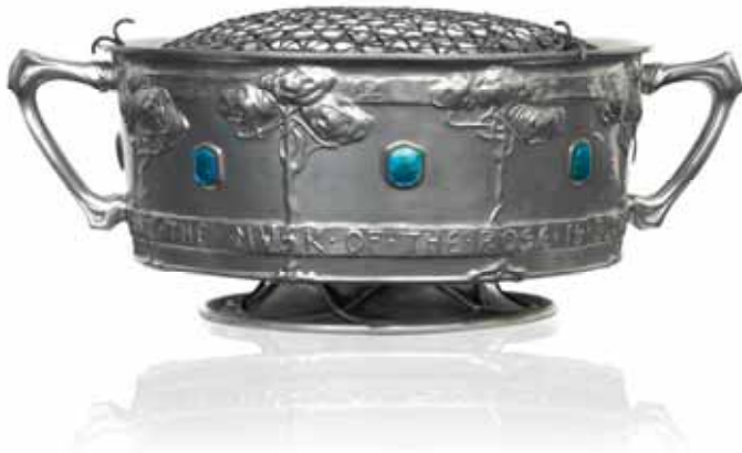
282 A TUDRIC ART NOUVEAU "LIBERTY" STYLE TWO HANDED PEWTER BOWL

The sides decorated with relief of rose trees interspersed by turquoise enamel roundels, with script 'And the musk of the rose is blown, and the woodsbine spices are wafted abroad', removable flower grid to interior, stamped 'H, Made in England, Tudric 001' to underside,