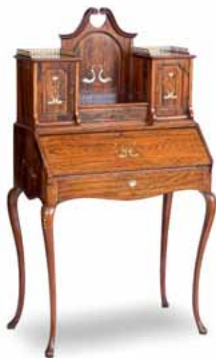
284 A LATE 19TH CENTURY ROSEWOOD MARQUETRY AND MOTHER OF PEARL INLAID BONHEUR DE JOUR

The upper section fitted with a drawer flanked by two cupboard doors above a fall front, raised on cabriole legs, 77cm wide, 48cm deep, 140cm high (30in wide, 18 1/2in deep, 55in high).