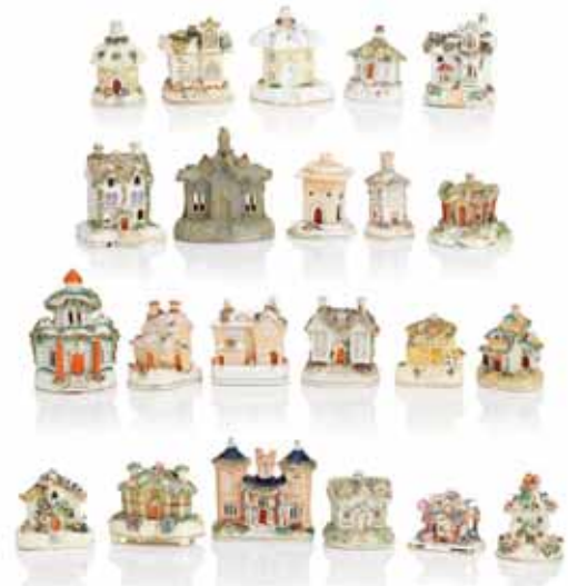
67 A COLLECTION OF TWENTY-TWO STAFFORDSHIRE COTTAGES AND PASTILLE BURNERS 19th Century and later With painted and encrusted floral decoration, three with detachable roof sections (22) £800 - 1,200 €870 - 1,300