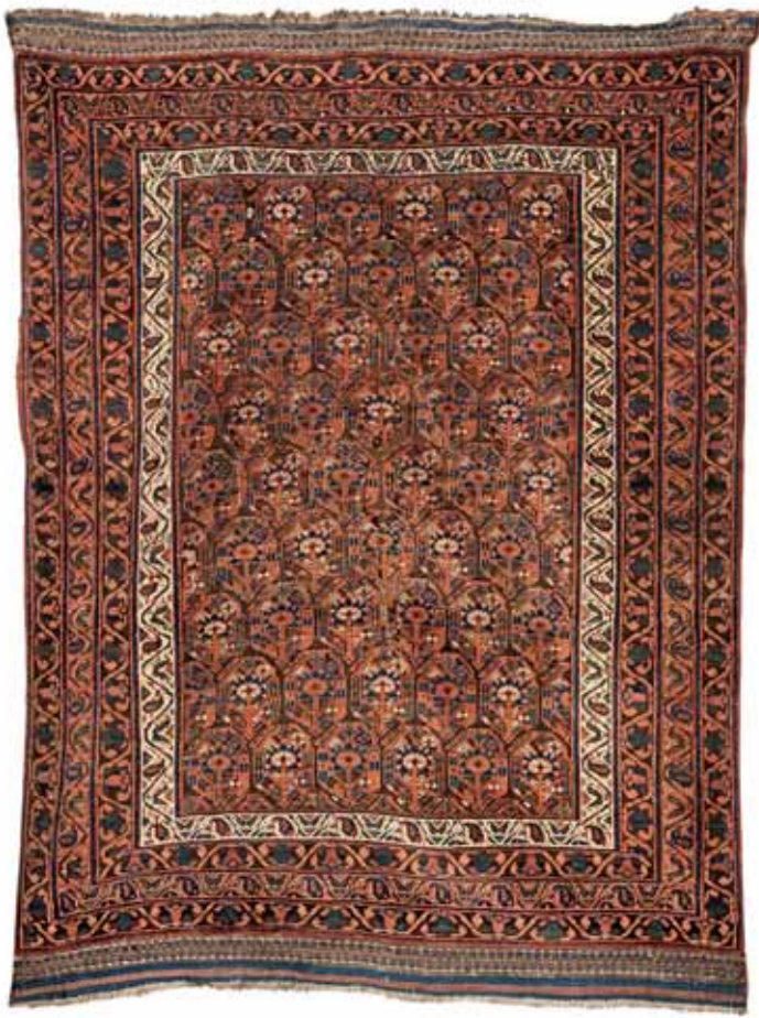
409 A SAUG BULACH RUG TP 161cm x 130cm £300 - 500 €330 - 550

See https://www.bonhams.com/ for further footnote on this lot