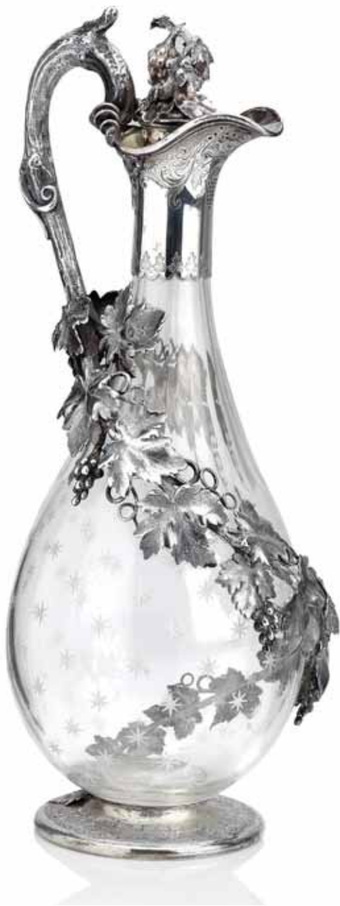
181 A VICTORIAN SILVER MOUNTED GLASS CLARET JUG by Barnard Bros., London 1866 The body etched all over with stars and applied with a cast garland of fruiting vines, the stopper formed as vines suspending grapes, height 34cm. £500 - 700 €550 - 760