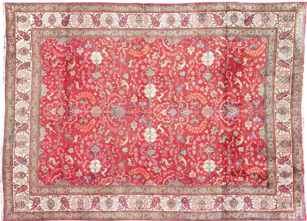
417 A NORTH WEST PERSIAN CARPET 293 x 394cm £500 - 800 €550 - 870