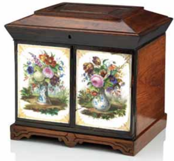
365 A 19TH CENTURY ROSEWOOD MAHOGANY AND PORCELAIN MOUNTED TWO DOOR TABLE CABINET With hinged lid above two porcelain panelled doors enclosing three graduated drawers, raised on bracket feet, 34cm wide, 29cm deep, 34cm high (13in wide, 11in deep, 13in high). £400 - 600 €440 - 660