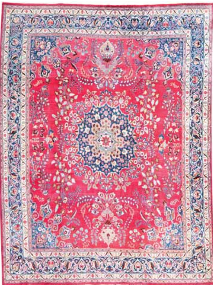
415 A MESHED CARPET 299cm x 323cm £700 - 1,000 €760 - 1,100