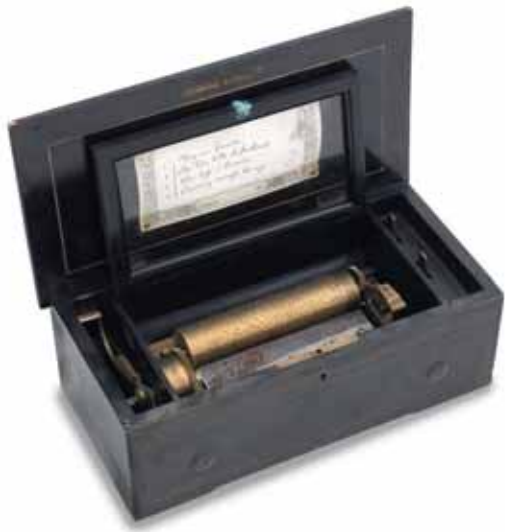
444 A 19TH CENTURY WALNUT MARQUETRY INLAID AND EBONISED CYLINDER MUSIC BOX Bearing paper label inscribed Fabrique de Geneve, No. 25659 With 14cm cylinder playing four airs, as per paper label, contained within a rectangular case, 33cm wide, 16cm deep, 13cm high (12 1/2in wide, 6in deep, 5in high) £400 - 600 €440 - 660