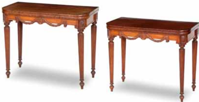
270 A PAIR OF 19TH CENTURY MAHOGANY CARD TABLES Each with rounded corners and baize playing surface, the frieze centred with mask medallion and foliate swags, raised on fluted turned legs, 92cm wide, 45cm deep, 74cm high (36in wide, 17 1/2in deep, 29in high). (2) £1,200 - 1,800 €1,300 - 2,000