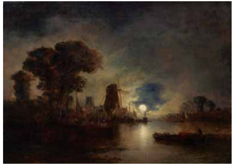
240 JOHN BERNEY CROME (BRITISH, 1794-1842) Moonlight over the river oil on canvas, 50 x 71cm (19 11/16 x 27 15/16in). £1,500 - 2,000 €1,600 - 2,200

See https://www.bonhams.com/ for further footnote on this lot