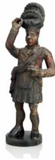
281 A 19TH CENTURY POLY-CHROME DECORATED CARVED WOOD TOBACCONIST'S FIGURE OF A SCOTTISH SOLDIER

Wearing a kilt, sporran, red coat, and feather bonnet, holding a pinch of snuff, raised on a later circular plinth, 25cm wide, 20cm deep, 75cm high (9 1/2in wide, 7 1/2in deep, 29 1/2in high)