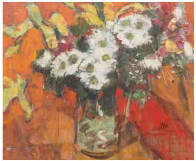
196 GORDON BRYCE RSA RSW (BRITISH, BORN 1943) AR Flowers in a Glass Jug signed, oil on canvas, 49.5 x 59.5cm (19 1/2 x 23 7/16in). £800 - 1,200 €870 - 1,300