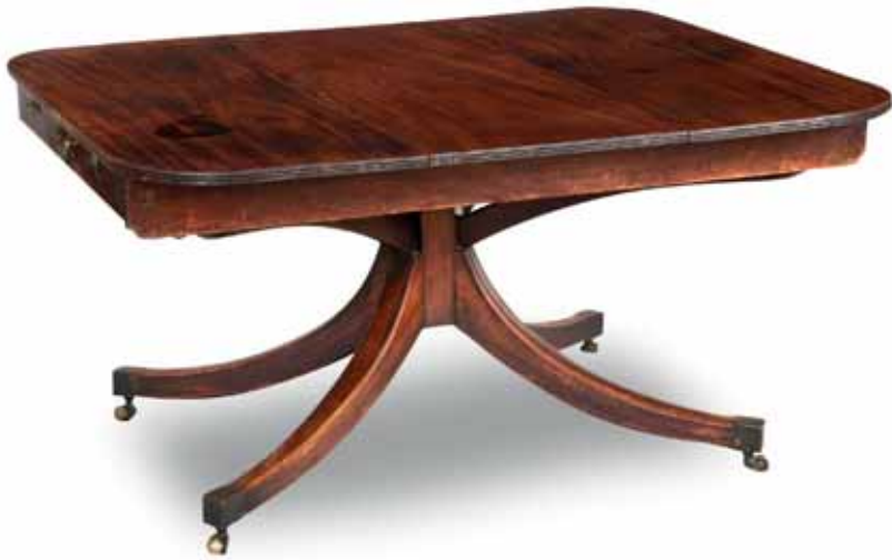
368 A REGENCY MAHOGANY EXTENDING POCOCK'S PATENT DINING TABLE The rounded rectangular top with reeded rim and single dummy drawer, stamped with brass trade plate engraved 'Pocock, Southampton Row, Covent Garden', raised on four splayed central pedestal legs with brass caps and castors, with two leaves, 90cm wide, 196cm deep, 69cm high (35in wide, 77in deep, 27in high). £800 - 1,200 €870 - 1,300

See https://www.bonhams.com/ for further footnote on this lot