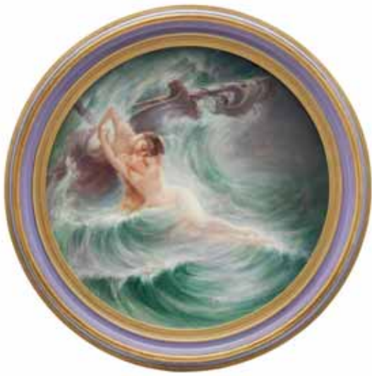
74 A TRESSEMANES & VOGT LIMOGES CIRCULAR PLAQUE Late 19th/early 20th Century Painted with a nude female figure embracing another figure amidst waves and a shipwreck, indistinct signature ***Phillips, 44cm diameter £300 - 500 €330 - 550

See https://www.bonhams.com/ for further footnote on this lot