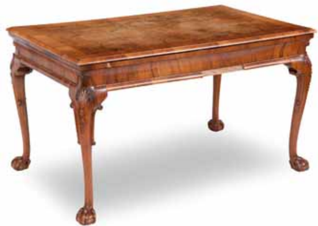
267 A 20TH CENTURY WALNUT AND CROSSBANDDED SIDE TABLE ATTRIBUTED TO WHYTOCK AND REID The rectangular top above frieze fitted with pair of drawers, raised on cabriole legs with carved knees and ball and claw feet, 122cm wide, 77cm deep, 69cm high (48in wide, 30in deep, 27in high). £300 - 500 €330 - 550