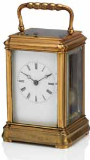
440 A 19TH CENTURY FRENCH REPEATING BRASS CARRIAGE CLOCK The 2 1/4 in. rectangular dial with Roman numerals, the twin train movement striking a gong, contained within a brass case with swing handles, together with its leather travelling case, 9cm wide, 8cm deep, 14cm high, (3 1/2in wide, 3in deep, 5 1/2in high) £300 - 1,350 €330 - 1,500