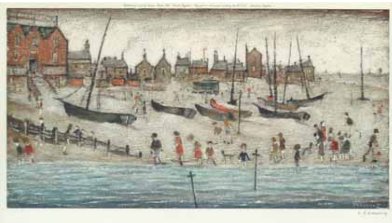
256B LAURENCE STEPHEN LOWRY R.A. (BRITISH, 1887-1976)

signed and dated 1889, oil on canvas, 50.5 x 76cm (19 7/8 x 29 15/16in.) unframed £800 - 1,200 €870 - 1,300