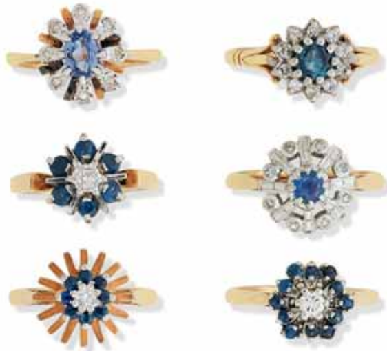
480 A COLLECTION OF GEM-SET AND DIAMOND RINGS Comprising: five of cluster design, one set with a tanzanite; some with sapphires, sizes K, K L½, L½, M; most stamped for 18 carat gold (6) £400 - 600 €440 - 660