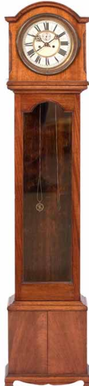
447 AN EARLY 20TH CENTURY MAHOGANY LONG CASE CLOCK, OF DIMINUTIVE SIZE The 7in. dial with Roman numerals and subsidiary seconds dial, the twin train weight driven movement striking a gong, contained within a case with glazed trunk, raised on a box base with bracket feet (probably constructed from a Vienna wall clock), 32cm wide, 19cm deep, 149cm high (12 1/2in wide, 7in deep, 58 1/2in high). £300 - 500 €330 - 550