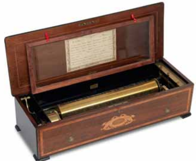
461 A LARGE 19TH CENTURY WALNUT AND MARQUETRY INLAID CYLINDER MUSIC BOX Stamped Nicole Freres, No. 44349 With 49cm cylinder playing eighteen airs, as per paper label, contained within a rectangular case, 80cm wide, 29cm deep, 20cm high (31in wide, 11in deep, 7 1/2in high) £2,000 - 3,000 €2,200 - 3,300