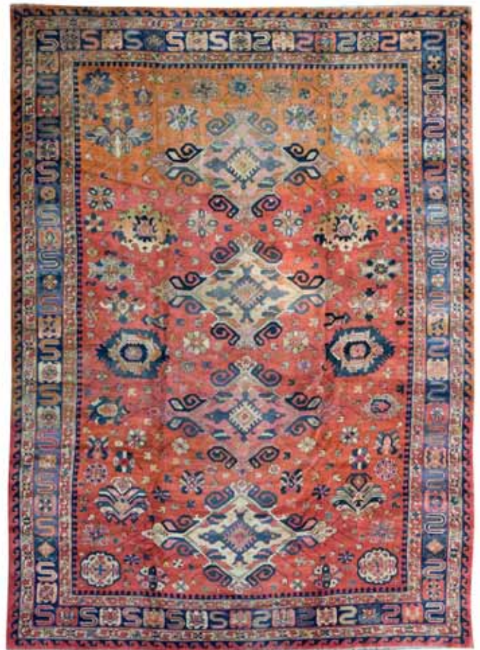
414 A EUROPEAN CARPET 402 x 300cm £1,500 - 2,000 €1,600 - 2,200