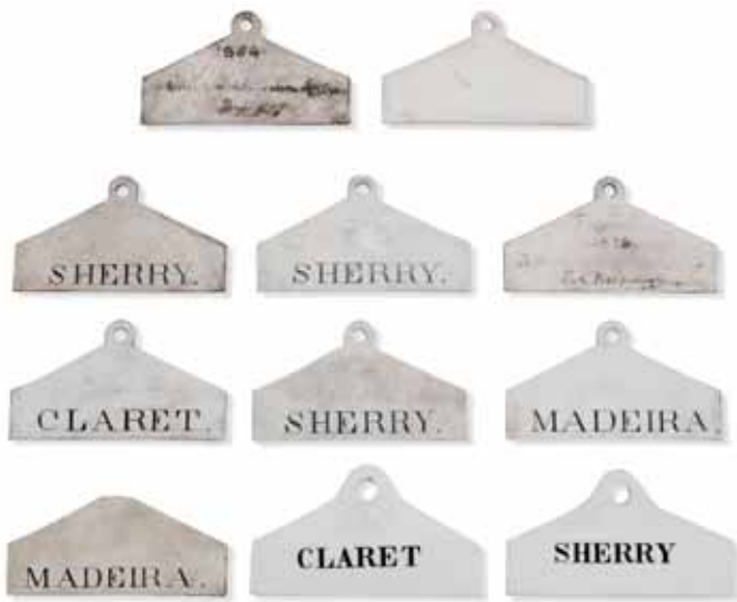
58 A COLLECTION OF WEDGWOOD AND OTHER WHITE STONEWARE BIN LABELS Circa 1800 Three for Sherry, two for Madeira, one for Claret and three blank, all of typical coat hanger form, some impressed WEDGWOOD, together with two later earthenware specimens for Claret and Sherry impressed "Farrow and Jackson, London" (11) £200 - 300 €220 - 330

See https://www.bonhams.com/ for further footnote on this lot