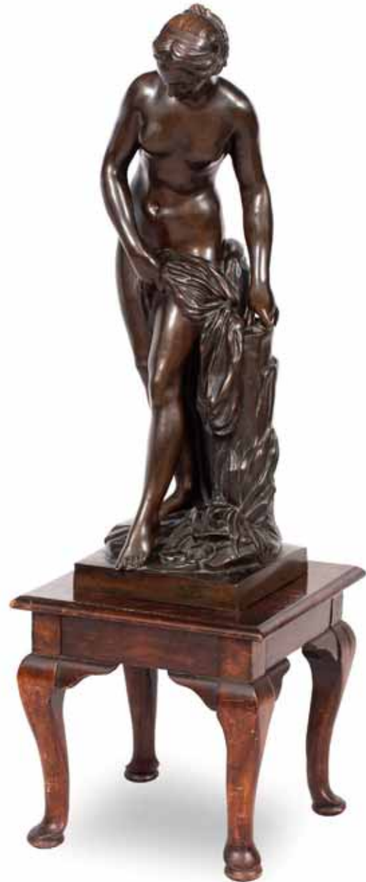
389 A LARGE LATE 19TH/EARLY 20TH CENTURY BRONZE STATUE OF A CLASSICAL MAIDEN Modelled on a naturalistic square base, together with an associate wooden base with cabriole legs, 25cm wide, 25cm deep, 208cm high (9 1/2in wide, 9 1/2in deep, 82in high) (2) £600 - 800 €660 - 870

See https://www.bonhams.com/ for further footnote on this lot