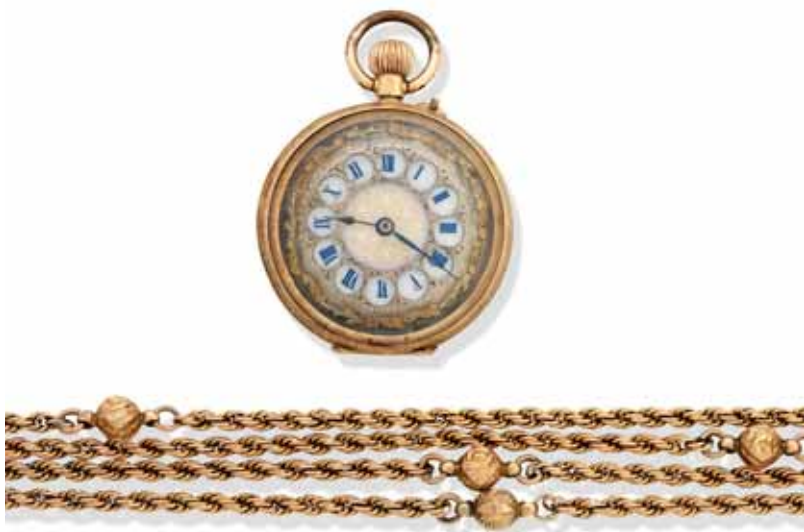
467 A LATE 19TH EARLY 20TH CENTURY 18CT GOLD KEYLESS FOB WATCH The white enamel dial with blue Roman numerals, cylindered movement, foliate engraved case, with 9ct double chain albert, 33mm diameter, the watch 31 grams, the chain 21 grams, (2) £700 - 900 €760 - 980