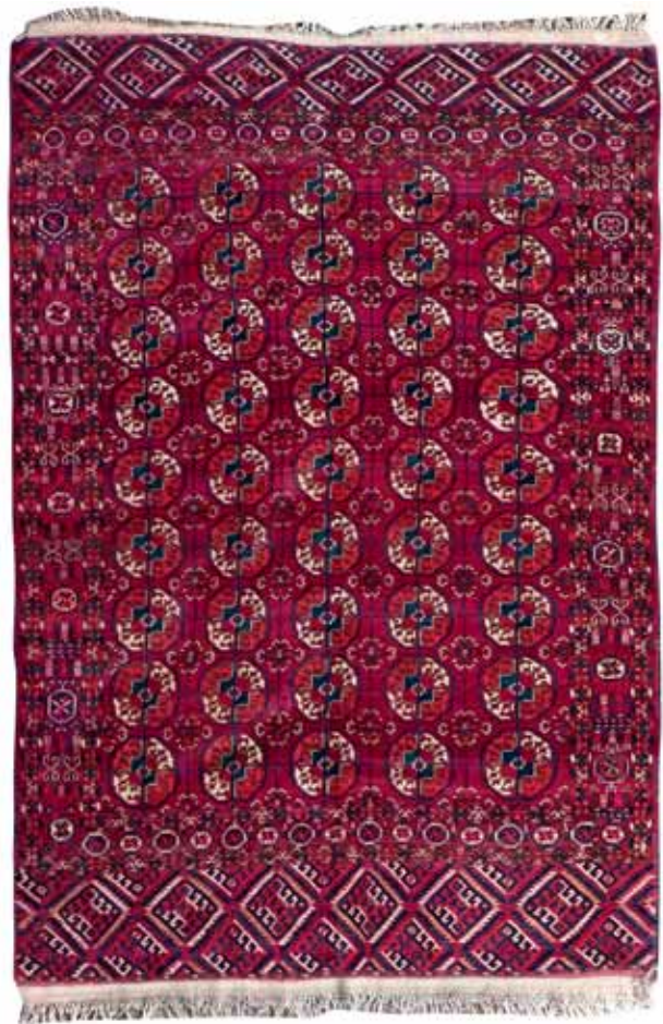
410 A TEKKE RUG 218cm x 122cm £200 - 300 €220 - 330

See https://www.bonhams.com/ for further footnote on this lot