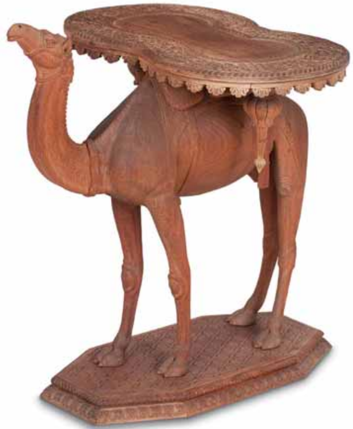
369 A 19TH CENTURY ANGLO-INDIAN CARVED TEAK CAMEL TABLE Carved in the form of a Dromedary camel, raised on octagonal carved base, 73cm wide, 58cm deep, 74cm high (28 1/2in wide, 22 1/2in deep, 29in high). £2,000 - 3,000 €2,200 - 3,300

See https://www.bonhams.com/ for further footnote on this lot