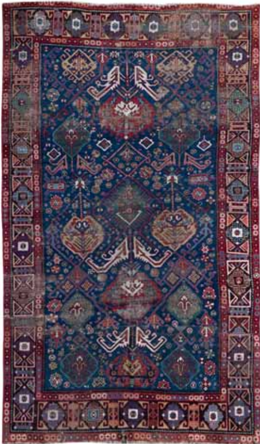
407 A SHIRVAN KUBA CARPET 170 x 277cm £300 - 500 €330 - 550