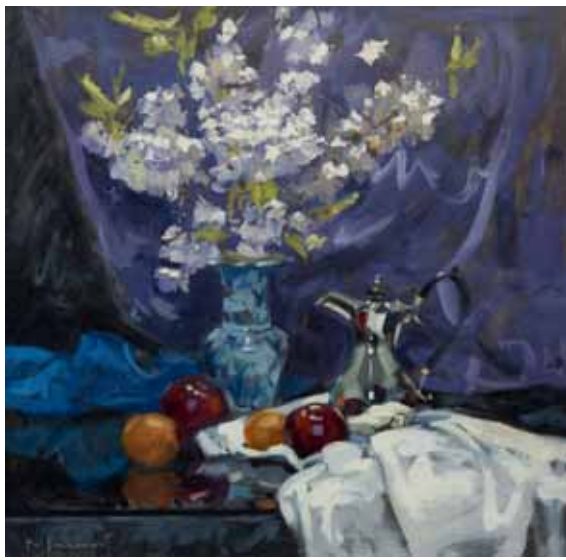
195 JACK MORROCCO (BRITISH, BORN 1953) AR Cherry Blossom with Silver Pot signed, on canvas, 61 x 61cm (24 x 24in). £2,000 - 3,000 €2,200 - 3,300