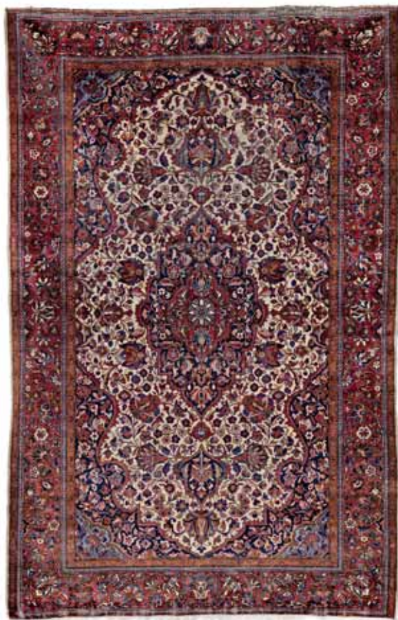
401 A SILK KASHAN CARPET Central Persia, 126cm x 197cm £500 - 800 €550 - 870

See https://www.bonhams.com/ for further footnote on this lot