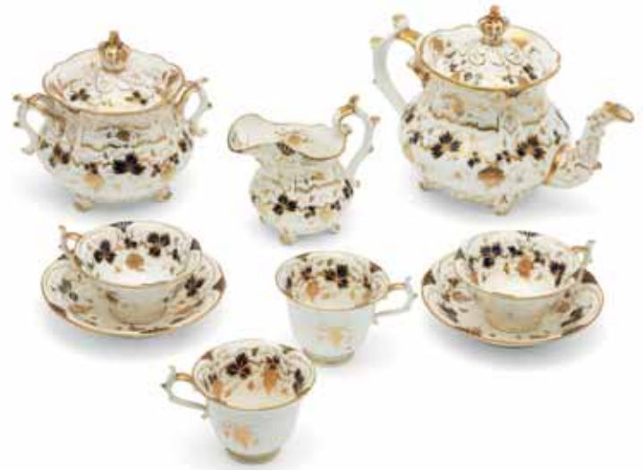
61 A ROCKINGHAM TEA SERVICE Circa 1830 Decorated in dark blue and gilt with a fruiting vine, comprising teapot and cover, sucrier and cover, milk jug, slop bowl, eight teacups, eight coffee cups, eleven saucers and two large plates, some pieces with puce printed factory mark (35) £300 - 500 €330 - 550