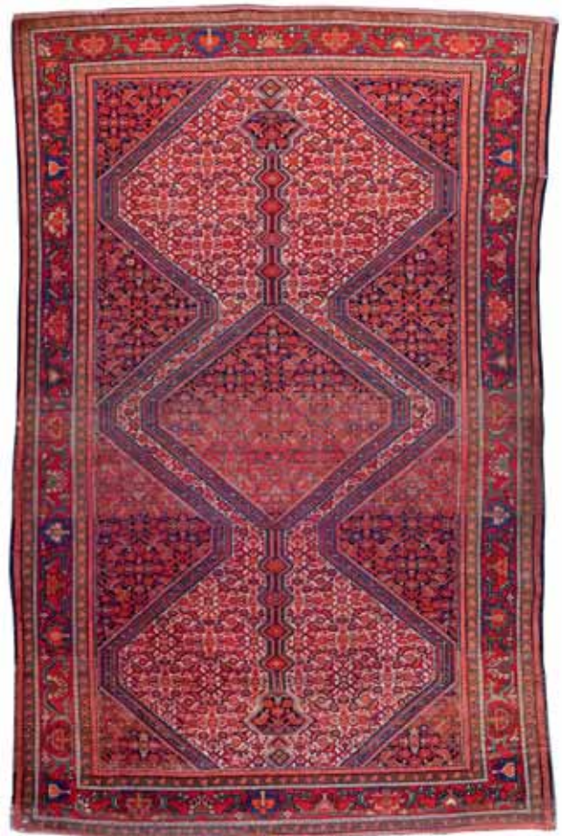
419 A MELAYIR FERAGHAN RUG 94.5cm x 132cm £500 - 700 €550 - 760