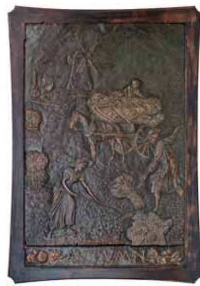
381 AN ART NOUVEAU EMBOSSED COPPER PLAQUE OF HARVESTERS TITLED 'AUTUMN' the Dutch landscape with windmill, cart and farm hands, in wooden frame, 93cm wide, 131cm high (36 1/2in wide, 51 1/2in high) £400 - 500 €440 - 550