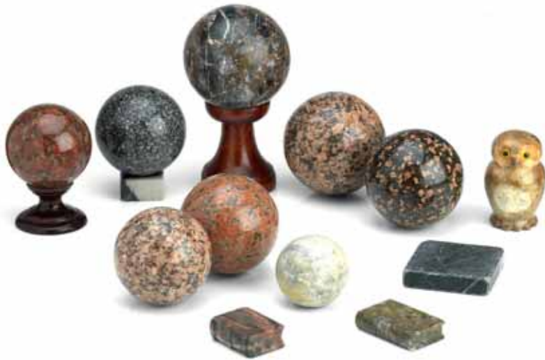
364 A COLLECTION OF MINERAL STONE SPHERES Of varying colours and sizes, (15 approx) £200 - 300 €220 - 330