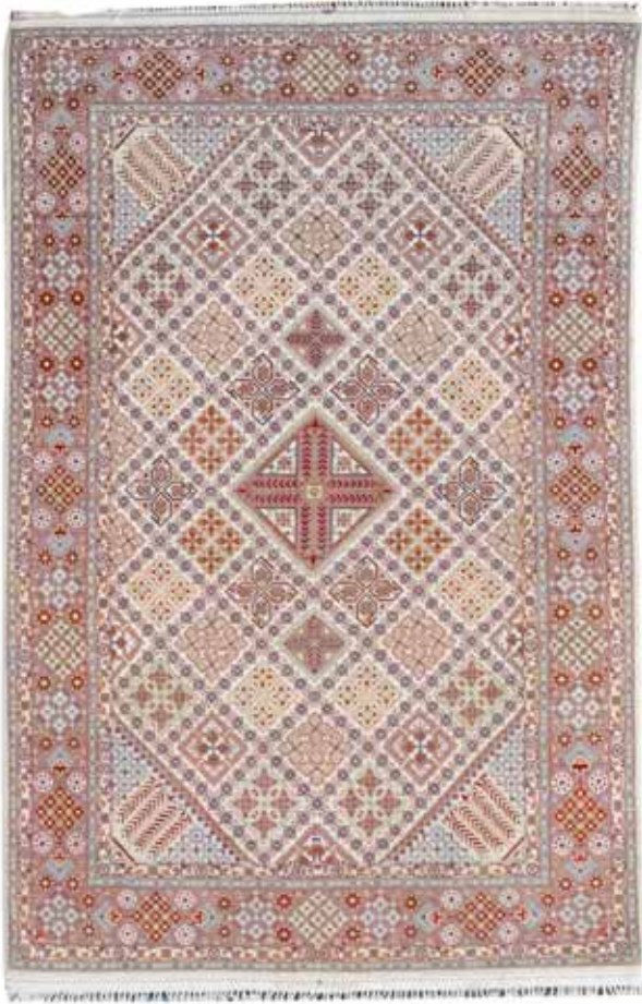
405 A GEOMETRIC ISFAHAN RUG 172 x 107cm £200 - 300 €220 - 330