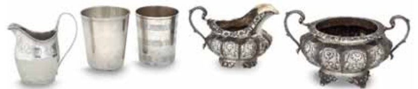
183 A COLLECTION OF ANTIQUE SILVER various makers and dates To include a George III beaker with reeded bands, London 1816 , a William IV silver cream jug and sugar bowl, of lobed form, London 1831 , etc, weight 53oz. £500 - 700 €550 - 760