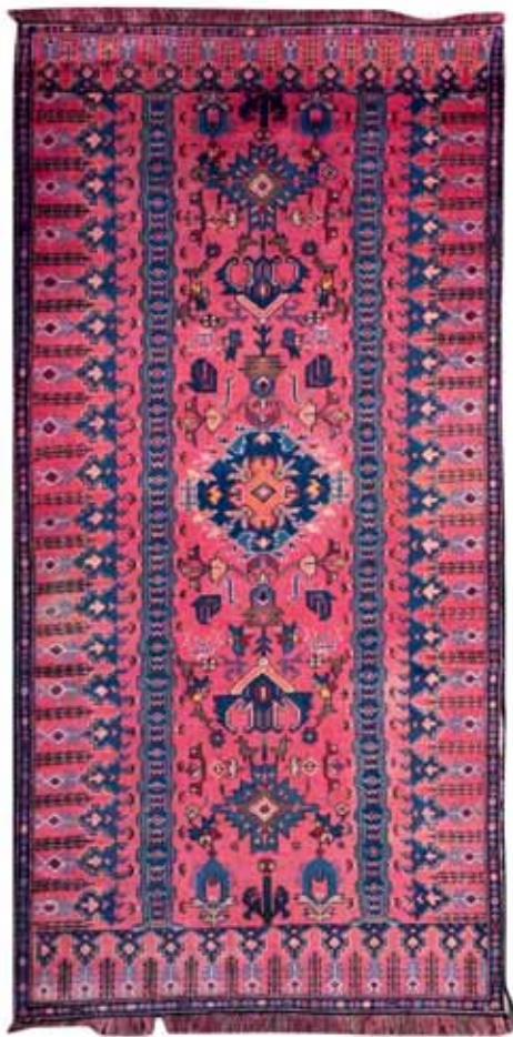
420 A TEKKE RUG West Turkestan, together with a turkish rug West Anatolia, 171cm x 109cm, 209cm x 109cm (2) £300 - 500 €330 - 550