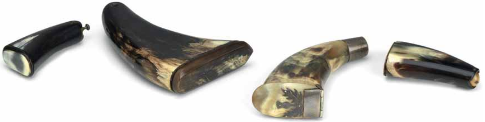
386 FOUR 19TH CENTURY COW HORN SNUFF MULLS The largest 15cm long, the smallest 8cm long (4) £400 - 600 €440 - 660