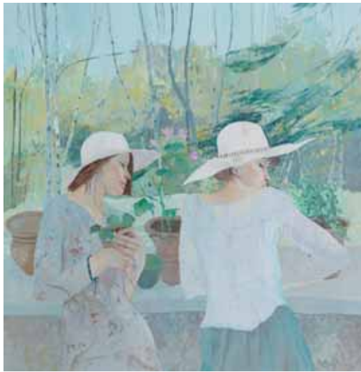
215 BRENDA LENAGHAN, RSW (BRITISH, BORN 1941)

AR Morning Moon signed, oil on canvas, 43 x 51cm (16 15/16 x 20 1/16in). £300 - 500 €330 - 550