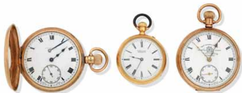
469 THREE GOLD POCKET WATCHES Comprising: a 9ct gold half hunter with Roman numerals and subsidiary seconds dial, by J W Benson, London, stamped '9' '375', diameter approximately 40mm; an open faced with Roman numerals and subsidiary seconds dial, by Thos Russells & Son, Liverpool, with 'Tempus Fugit' motif, stamped '9' '375', diameter approximately 42mm; and a smaller open faced with Roman numerals, by Bright & Sons, Scarborough, stamped '18K', diameter approximately 31mm; gross weight approximately 230 grams (3) £350 - 450 €380 - 490