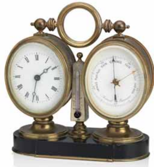
453 A LATE 19TH CENTURY BRASS DESK TIMEPIECE COMPENDIUM Fitted with timepiece, barometer, and alcohol thermometer, mounted on a polished slate base, 16cm wide, 7.5cm deep, 17.5cm high, (6 in wide, 2 1/2 in deep, 6 1/2 in high) £300 - 400 €330 - 440

See https://www.bonhams.com/ for further footnote on this lot