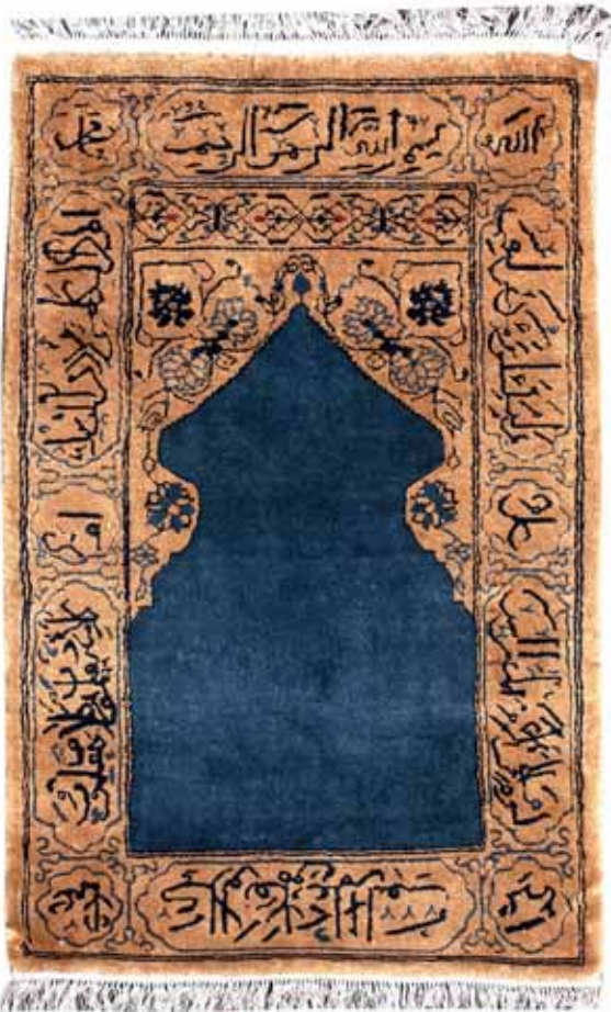
411 A SILK PRAYER RUG, West Anatolia together with an Indian rug and a Kashgai rug from South West Persia 94cm x 59cm, 111cm x 62cm, 119.5cm x 89cm (3) £200 - 300 €220 - 330

See https://www.bonhams.com/ for further footnote on this lot