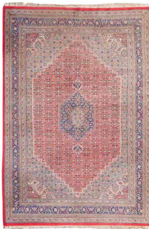
402 A HERATI DESIGN CARPET 255cm x 353cm £400 - 600 €440 - 660

See https://www.bonhams.com/ for further footnote on this lot