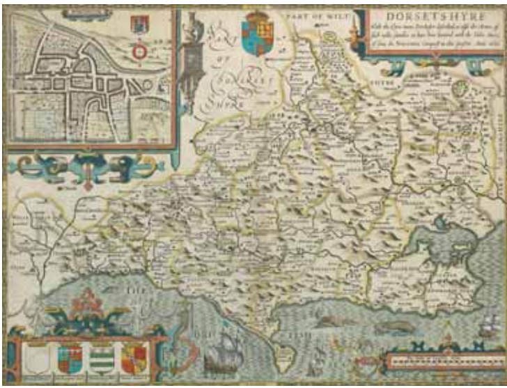
380 A GROUP OF THREE 17TH/18TH CENTURY MAPS OF SOUTH WEST ENGLAND Including an example by Speed, entitled 'Dorsetshyre', another entitled the 'Road from London to Weymouth' and the final example entitled 'Dorset shire', by Eman Bowen, 51cm x 38cm, 50cm x 35cm, and 53cm x 43cm, (3). £300 - 500 €330 - 550