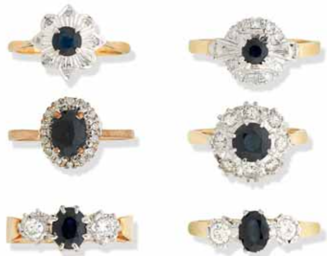
483 A COLLECTION OF GEM-SET AND DIAMOND RINGS Comprising: four of cluster design and two of three-stone design, most set with sapphires, sizes J½, L, M, N, O, P; most stamped for 18 carat gold (6) £400 - 600 €440 - 660