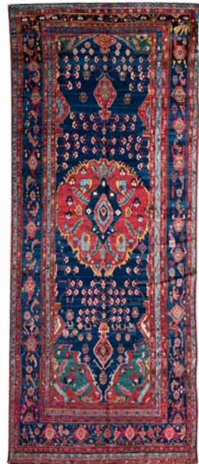
421 A KARABAGH RUG 380cm x 156cm £600 - 800 €660 - 870

See https://www.bonhams.com/ for further footnote on this lot