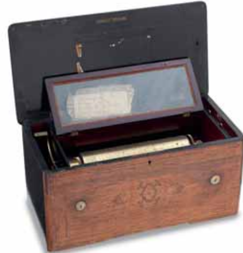
455 A 19TH CENTURY ROSEWOOD AND MARQUETRY INLAID CLYINDER MUSIC BOX Y With 22cm cylinder and concealed bells and drums, playing four airs, as per paper label, contained within a rectangular case, 43cm wide, 21cm deep, 21cm high (16 1/2 in wide, 8 in deep, 8 in high) £500 - 800 €550 - 870