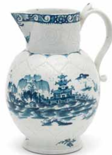
63 A LOWESTOFT JUG Circa 1765 With a cylindrical neck and scrolled handle, the neck and top of the globular body moulded in relief with flowers and leaves, painted in blue with Chinese river scenes, and 'scroll and flower' border below the rim, 26cm high, painter's number 5 for Robert Allen inside footrim £800 - 1,000 €870 - 1,100

See https://www.bonhams.com/ for further footnote on this lot