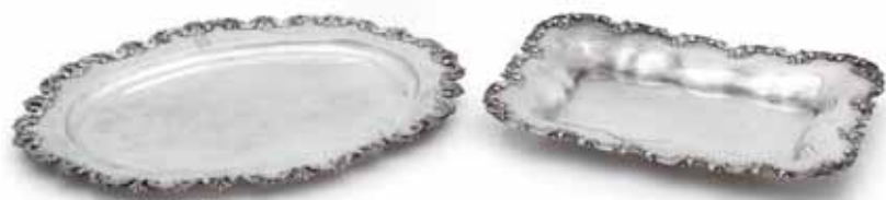
143 AN AMERICAN SILVER OVAL MEAT DISH by Shreve & Co. With a scrolling foliate border, length 46cm , and a rectangular fluted dish with scroll and rose border, by Towle Silversmiths, Massachusetts , weight 68oz. (2) £700 - 900 €760 - 980