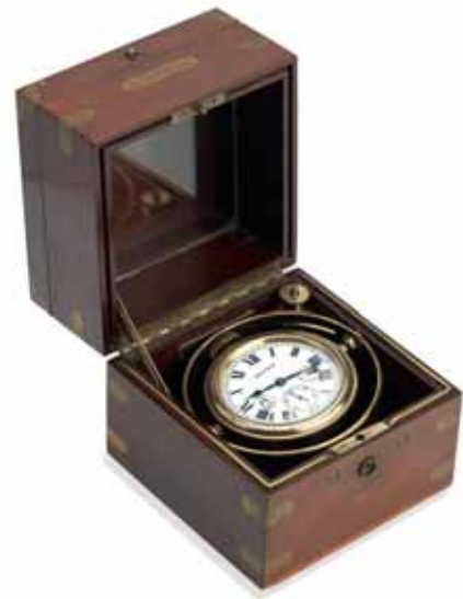
459 A LATE 20TH CENTURY EIGHT-DAY DECK WATCH IN A MAHOAGANY CASE, WALTHAM, Number 17406300 The three-tiered case with gimballed 2 1/4in. signed white dial with Arabic numerals, subsidiary seconds and state of wind warning aperture, the nickel plated half plate movement with lever escapement, 12.5cm wide, 13cm deep, 12cm high, (4 1/2in wide, 5 in deep, 4 1/2in high) £250 - 350 €270 - 380