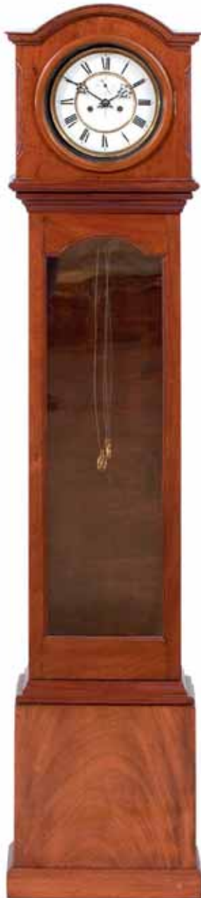
446 AN EARLY 20TH CENTURY MAHOGANY LONG CASE CLOCK, OF DIMINUTIVE SIZE The 7in. dial with Roman numerals, subsidiary seconds dial, the twin train weight driven movement striking a gong, contained within a case with glazed trunk raised on a box base with bracket feet (probably constructed from a Vienna wall clock), 31cm wide, 18cm deep, 147cm high (12in wide, 7in deep, 57 1/2in high). £400 - 600 €440 - 660