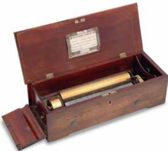
462 A LATE 19TH CENTURY MARQUETRY INLAID WALNUT CASED KEY WIND CYLINDER MUSIC BOX Inscribed Nicole Freres for T Cox Savery & Co., No. 33091 23cm cylinder, playing four airs as per paper label, contained within a marquetry inlaid rectangular case, 41cm wide, 16cm deep, 12cm high (16in wide, 6in deep, 4 1/2in high) £600 - 900 €660 - 980