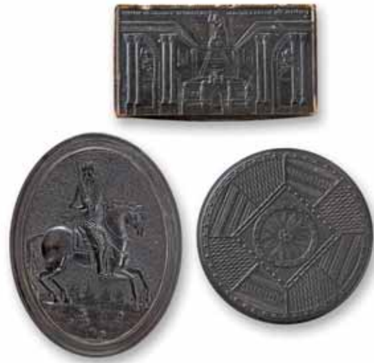
263 AN 18TH CENTURY OVAL PRESSED HORN BOX DEPICTING PETER THE GREAT ON HORSEBACK Peter shown wearing laurel wreath and holding sword, against textured background, together with two other pressed horn boxes including a rectangular snuff box with hinged lid decorated with classical interior, 10.5cm wide, 8cm deep, 2.5cm high (4in wide, 3in deep, 0 1/2in high) and 8cm and 9.5cm wide (3) £1,500 - 2,500 €1,600 - 2,700 See https://www.bonhams.com/ for further footnote on this lot