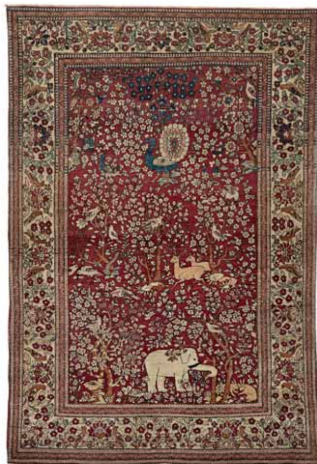
404 AN ISFAHAN CARPET Central Persia, 205cm x 136cm £400 - 600 €440 - 660

See https://www.bonhams.com/ for further footnote on this lot