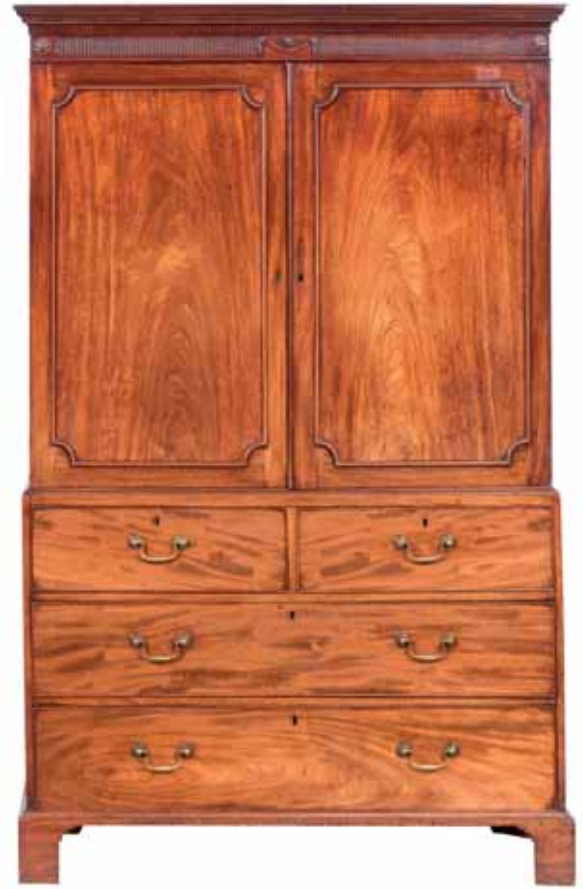
291 A GEORGE III MAHOGANY LINEN PRESS The moulded cornice above a pair of cupboard doors enclosing slides, the lower section with two short and two long drawers raised on bracket feet, 131cm wide, 59cm deep, 207cm high (51 1/2in wide, 23in deep, 81in high). £350 - 550 €380 - 600