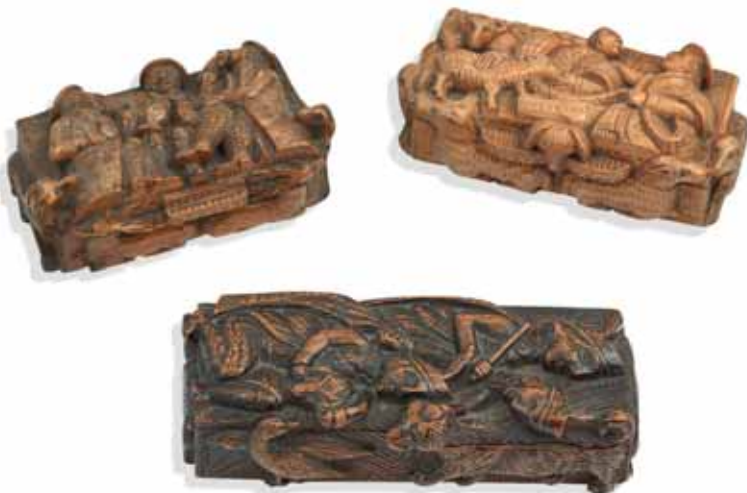
384 A GROUP OF THREE 19TH CENTURY SCOTTISH CARVED TREE SNUFF BOXES By repute carved by the Blind Man of Ayrshire, Each carved with depictions of Scottish characters, one example possibly depicting a scene from Robert Burns 'Willie Brew'd a Peck O' Maut', The largest 20cm wide, 10cm deep, 6cm high (7 1/2in wide, 3 1/2in deep, 2in high). (3) £600 - 900 €660 - 980

See https://www.bonhams.com/ for further footnote on this lot