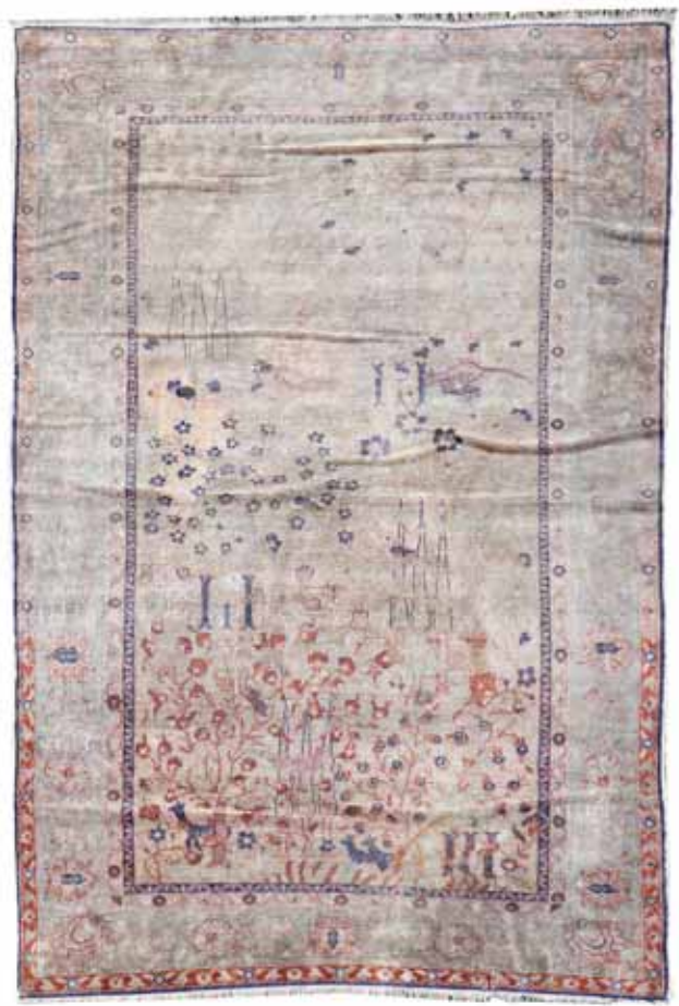
412 A TURKISH RUG West Anatolia, 178cm x 118cm £300 - 500 €330 - 550