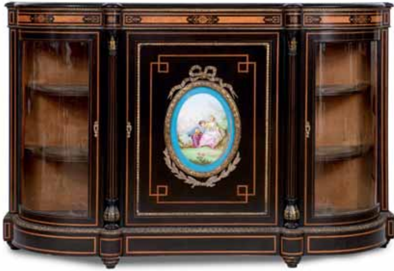
290 A 19TH CENTURY EBONISED GILT METAL AND PORCELAIN MOUNTED CREDEZA The bowfront top above cupboard doors centered with a porcelain plaque depicting a courting couple, flanked by glazed cupboard doors enclosing shelves, raised on plinth with bun feet, 170cm wide, 41cm deep, 107cm high (66 1/2in wide, 16in deep, 42in high). £600 - 800 €660 - 870