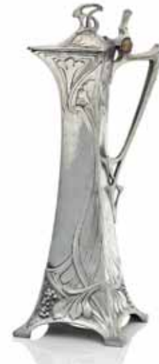
283 A GERMAN WMF ART NOUVEAU CONTINENTAL PEWTER CLARET JUG

The tapering, slender, diamond shaped body decorated with stylised floral relief, with hinged lid and handle to corner edge, raised on four out-swept bracket feet, stamped 'WMF, B, I/O, as' to base, 35cm high, 17cm wide