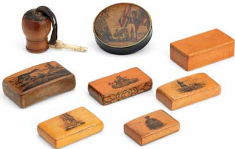
388 A GROUP OF EIGHT PENWORK SNUFF BOXES (For full description please visit www.bonhams.com ) £400 - 600 €440 - 660

See https://www.bonhams.com/ for further footnote on this lot