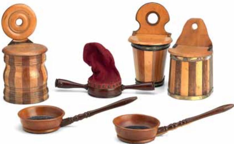
378 A SMALL COLLECTION OF 19TH CENTURY WOODEN ITEMS Comprising three salt buckets with hinged lids, two 'skillets' and a two-handled church collection bag (6) £600 - 900 €660 - 980