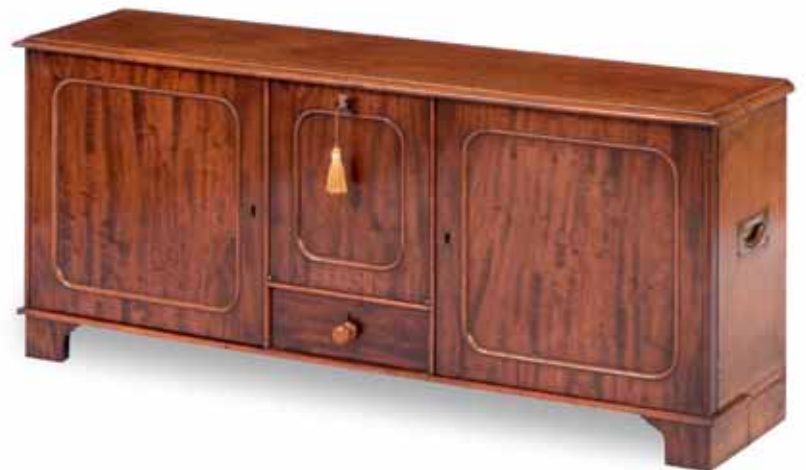
367 A 19TH CENTURY MAHOGANY TABLE TOP CABINET, STAMPED WILKINSON & SON, 60 OLD BOND STREET With three cupboard doors and central drawer, the sides fitted with recessed brass loop handles, 103cm wide, 26cm deep, 46cm high (40 1/2in wide, 10in deep, 18in high). £300 - 500 €330 - 550