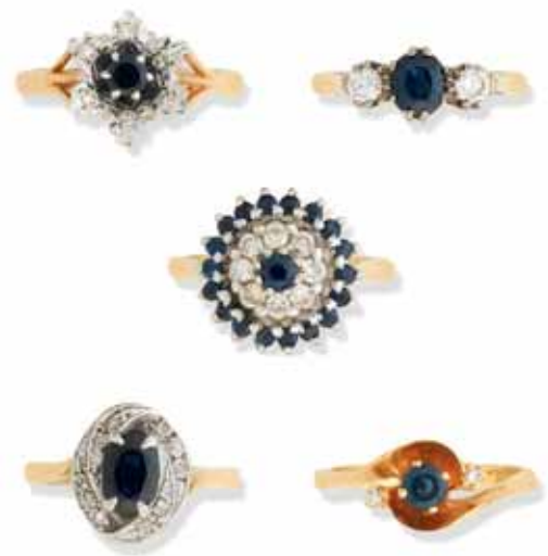
479 A COLLECTION OF GEM-SET AND DIAMOND RINGS Comprising: four of cluster design; one of three-stone design, some set with sapphires, sizes L, L, N, O, O, all stamped for 18 carat gold (5) £400 - 600 €440 - 660