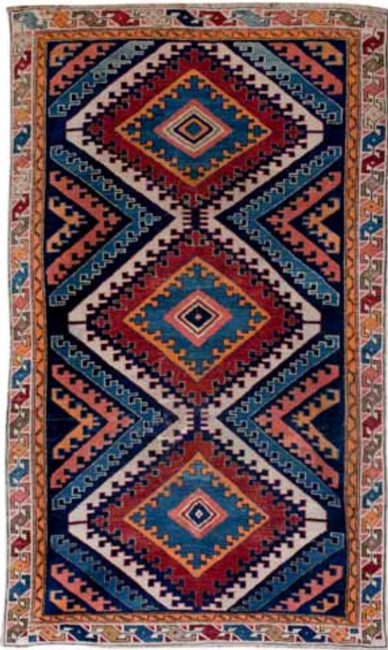
413 A 19TH CENTURY KURDISTAN RUG 102cm x 169cm £600 - 800 €660 - 870