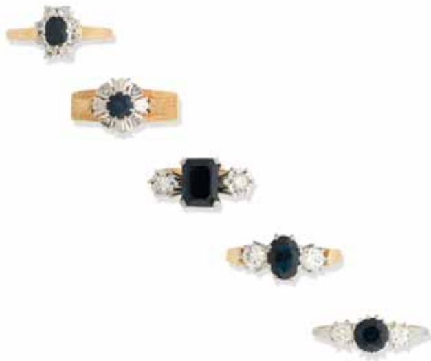
478 A COLLECTION OF SAPPHIRE AND DIAMOND RINGS Comprising: three of three-stone design and two of cluster design, some set with sapphires, sizes H½ K, M, N, N½; all stamped for 18 carat gold (5) £400 - 600 €440 - 660