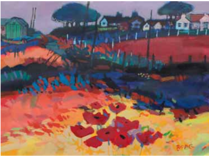
256 FRANCIS BOAG (BRITISH, 1948)

signed, oil on canvas, 102.5 x 153 cm. (40 3/8 x 60 1/4 in.) £1,000 - 1,500 €1,100 - 1,600