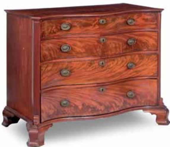
266 A GEORGE III MAHOGANY SERPENTINE CHEST OF DRAWERS The shaped top with moulded edge and canted angles, fitted with four graduated drawers raised on ogee moulded bracket feet, 121cm wide, 64cm deep, 92cm high (47 1/2in wide, 25in deep, 36in high). £600 - 800 €660 - 870