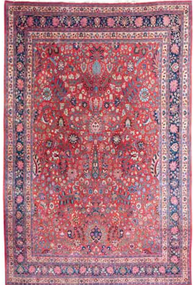
408 A 20TH CENTURY MESHED WOOL CARPET 351cm x 480cm £500 - 800 €550 - 870