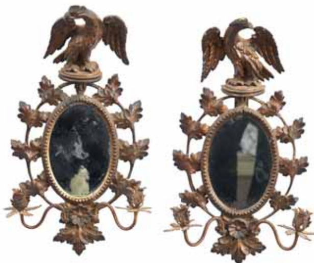
304 A PAIR OF 19TH CENTURY GILTWOOD AND GESSO GIRANDOLES Each with eagle finial above oval mirror mounted by beading and foliate leaf decoration, with a pair of candle holder branches in the form of leaves to base, 33cm wide 59cm high, (12 1/2in wide 23in high) (2) £400 - 600 €440 - 660

See https://www.bonhams.com/ for further footnote on this lot