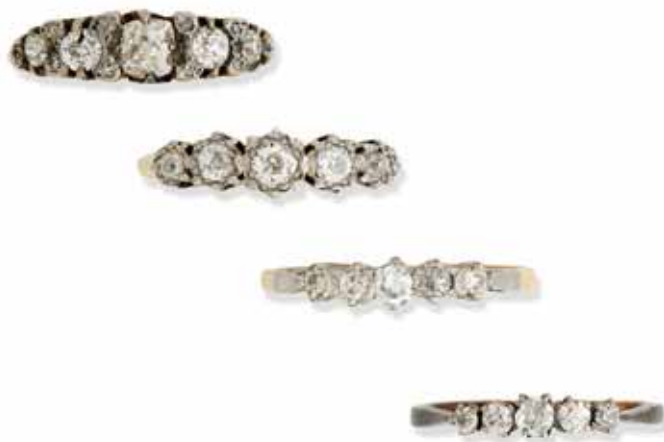
482 A COLLECTION OF FIVE-STONE DIAMOND RINGS Comprising: four five-stone diamond rings of various designs, set with old round brilliant-cut and round brilliant-cut diamonds, sizes K, M, N½, S, estimated total diamond weight approximately 2.50cts, most stamped for 18 carat gold (4) £400 - 600 €440 - 660