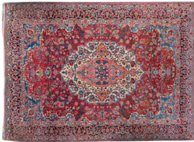
398 AN ISFAHAN CARPET 305 x 206cm £800 - 1,200 €870 - 1,300