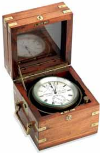
452 A 19TH CENTURY MAHOGANY CASED TWO DAY SHIP'S CHRONOMETER The dial engraved 'Barraud, London 41 Cornhill No. 5109' For full description see Bonhams.com, 19.5cm wide, 20cm deep, 19cm high, (7 1/2 in wide, 7 1/2 in deep, 7 in high) £1,000 - 1,500 €1,100 - 1,600

See https://www.bonhams.com/ for further footnote on this lot