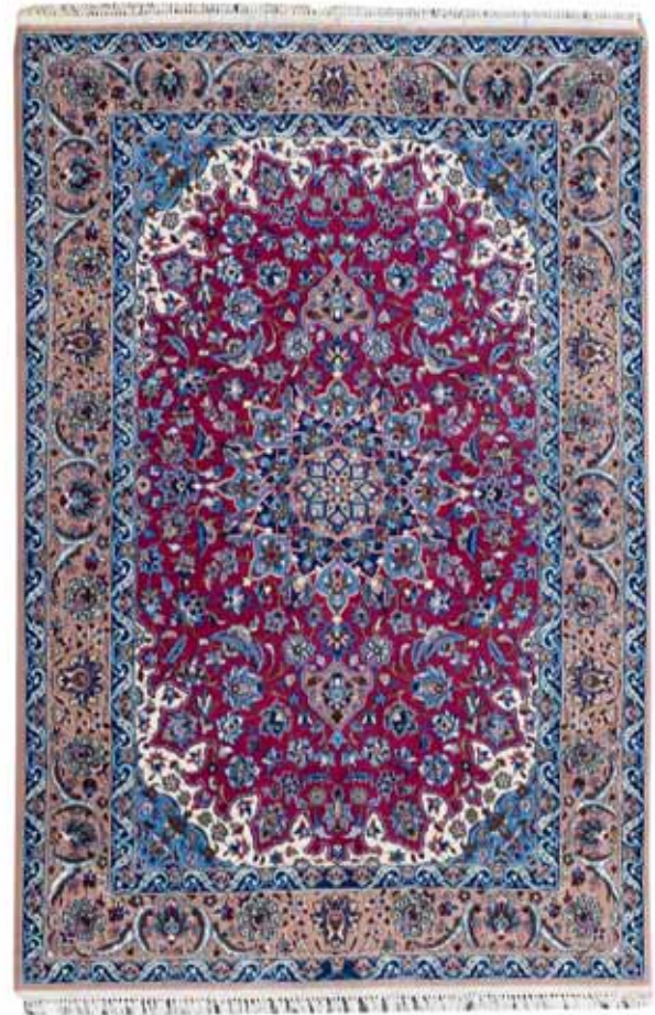
406 A RED GROUND ISFAHAN RUG 160 x 110cm £400 - 600 €440 - 660