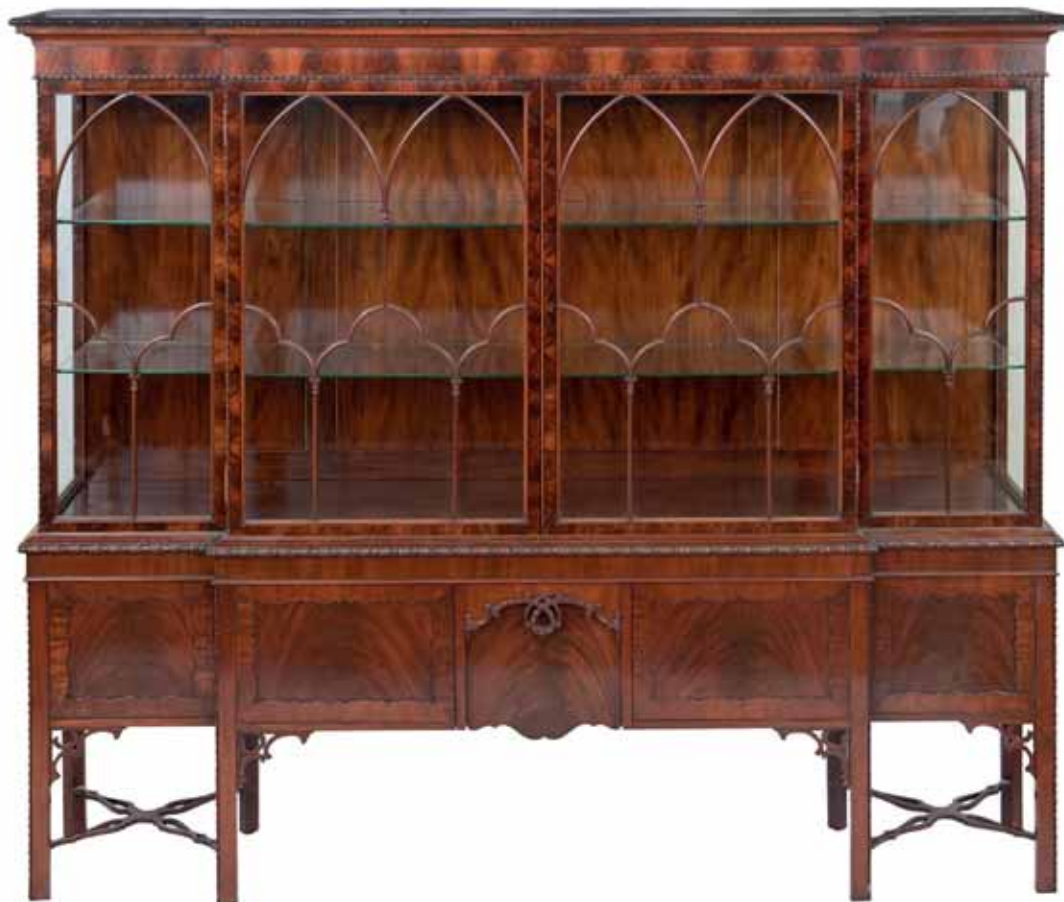
370 AN EDWARDIAN MAHOGANY BREAKFRONT ASTRAGAL DISPLAY CABINET The upper section fitted with four glazed doors enclosing glass shelves, the lower section fitted with four cupboard doors, raised on square section supports with fretted stretchers, 211cm wide, 38cm deep, 180cm high (83in wide, 14 1/2in deep, 70 1/2in high). £500 - 700 €550 - 760