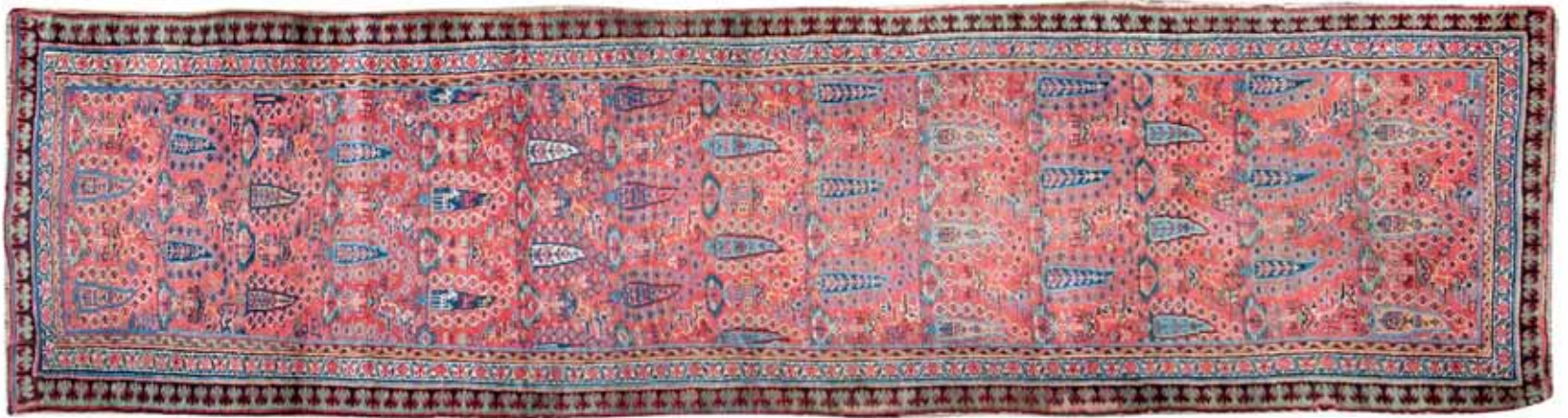
399 A BIDJAR RUNNER 365cm x 95cm £400 - 600 €440 - 660