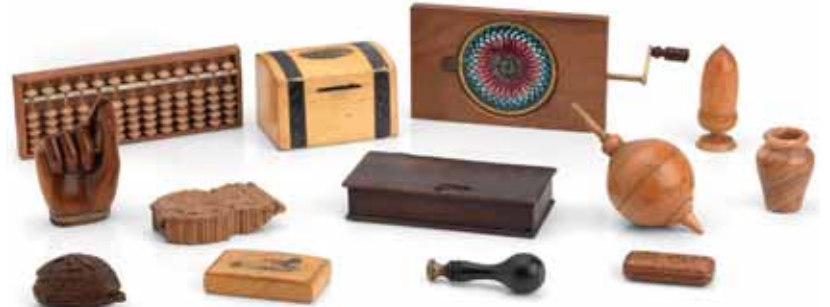
303 A COLLECTION OF TREEN AND MAUCHLINE WARE SNUFF BOXES Including a gold mounted horn example and a carved coquilla nut (qty) (For full description please visit www.bonhams.com ) £500 - 700 €550 - 760

See https://www.bonhams.com/ for further footnote on this lot