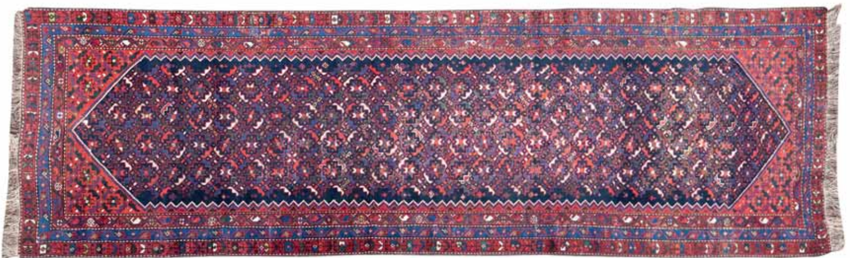
400 A SHIRAZ RUNNER 330cm x 102cm £400 - 600 €440 - 660