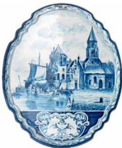
68 AN OVAL DUTCH DELFT PLAQUE 19th Century Of oval cartouche form, painted in blue with figures unloading ships beside quayside buildings, 57cm x 47cm £200 - 300 €220 - 330