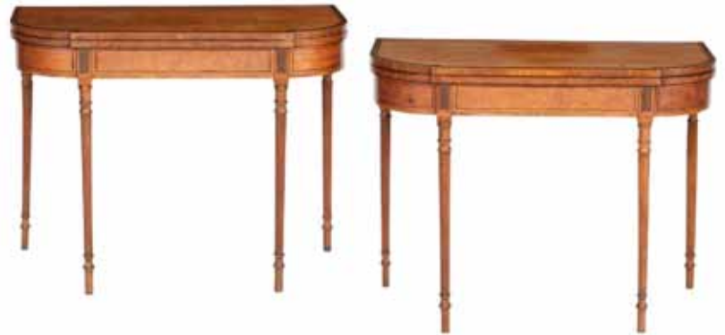
265 A PAIR OF GEORGE III SATINWOOD CROSSBANDDED CARD TABLES Each with break bow front folding tops enclosing green baize interior, crossbanded and inlaid frieze, on slender reeded turned and tapered legs, 95cm wide, 45cm deep, 74cm high (37in wide, 17 1/2in deep, 29in high). (2) £2,000 - 3,000 €2,200 - 3,300