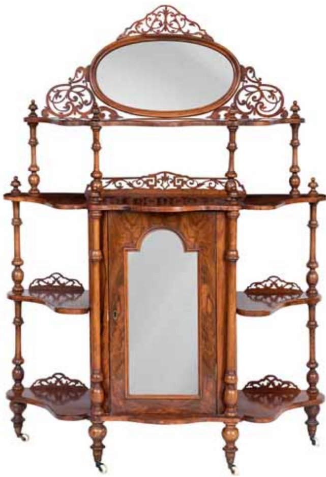
371 A 19TH CENTURY WALNUT WHAT NOT With central oval mirror on fretwork supports above three tiers, the lower with central cupboards, raised on turned supports with brass caps and pottery castors, 103cm wide, 37cm deep, 144cm high (40 1/2in wide, 14 1/2in deep, 56 1/2in high). £500 - 700 €550 - 760