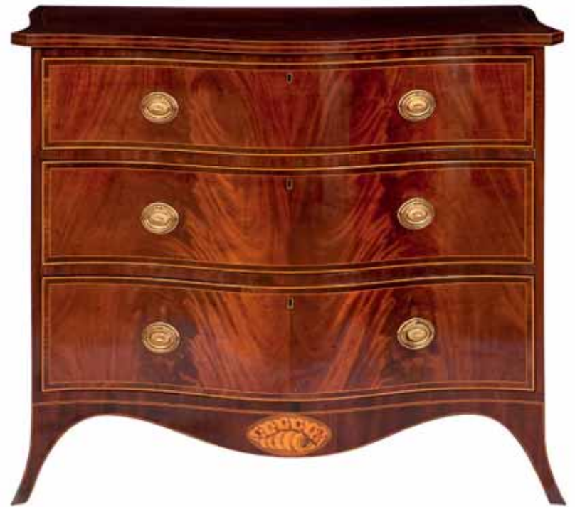
372 A GEORGE III AND LATER MAHOGANY AND INLAID SERPENTINE CHEST stamped "from W Williamson and Sons Guildford" The shaped top above three graduated drawers raised on outswept bracket feet, 115cm wide, 65cm deep, 98cm high (45in wide, 25 1/2in deep, 38 1/2in high). £1,000 - 1,500 €1,100 - 1,600

See https://www.bonhams.com/ for further footnote on this lot