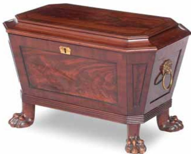
366 A LATE 19TH CENTURY MAHOGANY CROSS BANDED CELLARETTE Of octagonal form with brass lion head handles, lead lined void interior, raised on lion paw feet, 76cm wide, 46cm deep, 48cm high (29 1/2in wide, 18in deep, 18 1/2in high). £800 - 1,200 €870 - 1,300