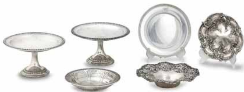
141 A PAIR OF AMERICAN SILVER TAZZE by International Silver Company With gadrooned rims, two foliate embossed dishes, eight small plates, six bowls, strainer, etc, weight 58oz. £600 - 800 €660 - 870