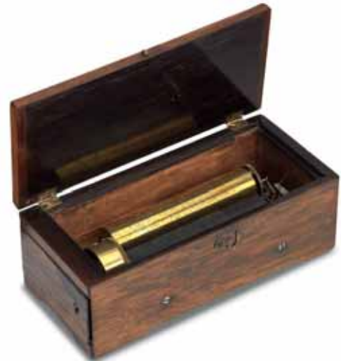
463 A SMALL 19TH CENTURY KEY WOUND ROSE WOOD CYLINDER MUSIC BOX Stamped Martinez Benoit 3083 The 11cm cylinder playing ????, contained within a rectangular case 20cm wide, 9cm deep, 7cm high (7 1/2in wide, 3 1/2in deep, 2 1/2in high) £400 - 600 €440 - 660