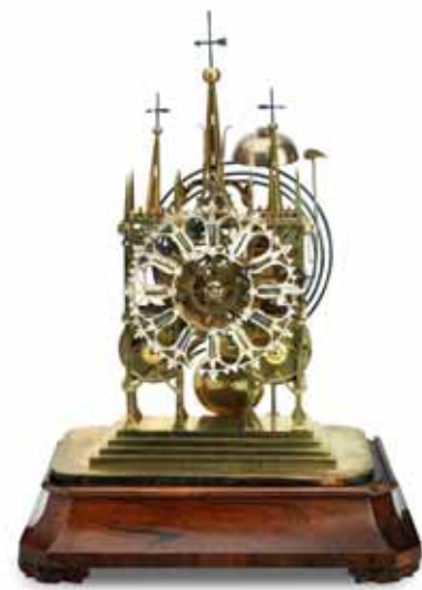
439 A 19TH CENTURY BRASS AND STEEL SKELETON CLOCK Y The 5 1/2in. pierced engraved dial with Roman numerals, the twin train chain drive fusee movement striking on a bell and gong, under a later perspex case raised on a moulded rosewood octagonal base with scrolling feet, 35cm wide, 27cm deep, 49cm high (13 1/2in wide, 10 1/2in deep, 19in high) £600 - 800 €660 - 870