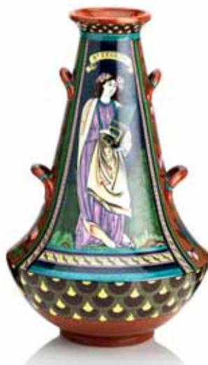
77 FREDERICK RHEAD FOR FOLEY POTTERY: AN INTARSIO 'ST CECILIA' VASE Circa 1900 With double twin handles, titled 'St Cecilia', decorated with two opposing panels of the saint holding a set of organ pipes, the sides with panels of birds and berries, the base with yellow, brown and green fish scale ground, 42cm high, printed mark and numbered 3024 £300 - 500 €330 - 550