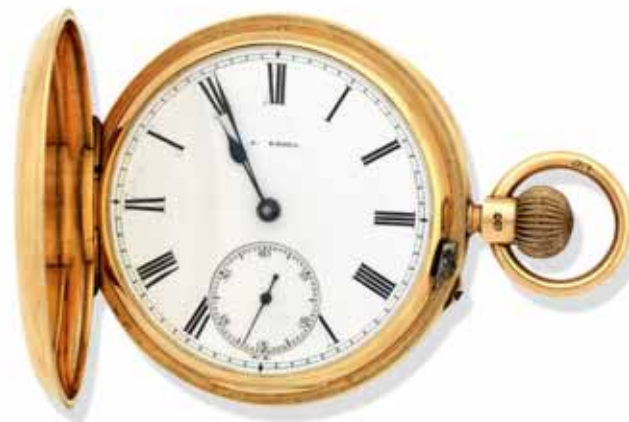
468 A 18CT GOLD KEYLESS FULL HUNTER POCKET WATCH A. Lessel, London, 1896 The white dial with Roman numerals and subsidiary seconds dial at six o'clock, stamped 'WS' '18', diameter approximately 41mm, gross weight approximately 110 grams £1,500 - 1,800 €1,600 - 2,000