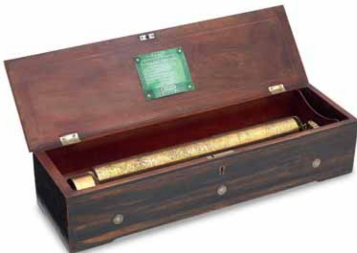
456 A 19TH CENTURY WALNUT AND MARQUETRY INLAID CYLINDER MUSIC BOX Stamped Nicole Freres A Geneve, 33252 With 44cm cylinder playing eight airs, as per paper label, contained within a rectangular case, 64cm wide, 20cm deep, 14cm high (25 in wide, 7 1/2 in deep, 5 1/2 in high) £800 - 1,200 €870 - 1,300