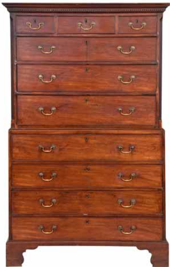
292 A GEORGE III MAHOGANY SECRETAIRE CHEST ON CHEST With moulded dentil cornice, above three short and three long drawers, the lower part fitted with a secretaire drawer above three long graduated drawers, on bracket feet, 114cm wide, 58cm deep, 189cm high (44 1/2in wide, 22 1/2in deep, 74in high). £600 - 800 €660 - 870