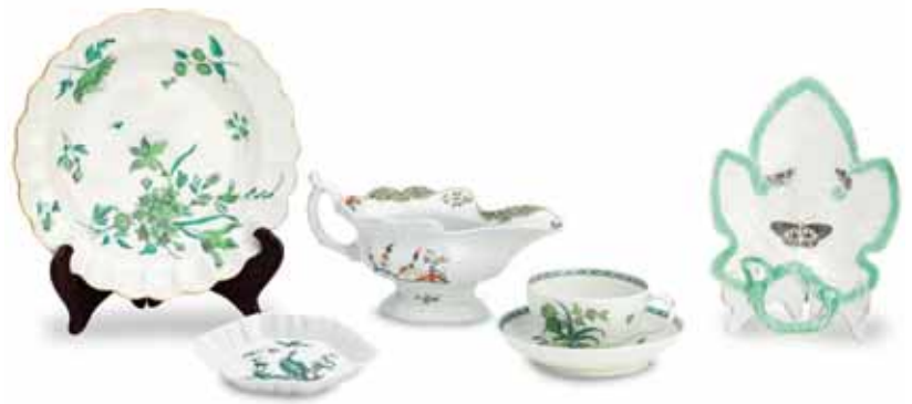
65 A GROUP OF WORCESTER PORCELAIN Circa 1755-65 Comprising a high-footed sauceboat of 'silver' shape, painted with birds amidst foliage within scrollwork cartouches, 19.5cm, a leaf dish printed in black with three butterflies, 18cm, and a plate, teacup and saucer and Chinese spoon tray painted in the London workshop of James Giles with sprays of green and gilt foliage (6) £600 - 800 €660 - 870