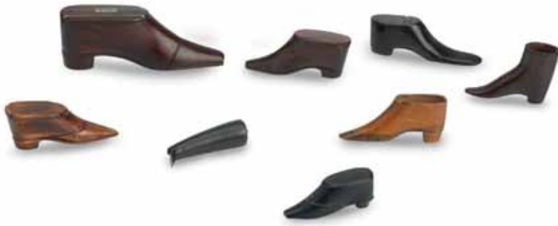
362 A COLLECTION OF 19TH CENTURY NOVELTY TREEN SNUFF MULLS Formed as shoes and boots, some with close nail decoration, including a pewter example and a horn walking stick handle in the form of a boot (11) £700 - 1,000 €760 - 1,100