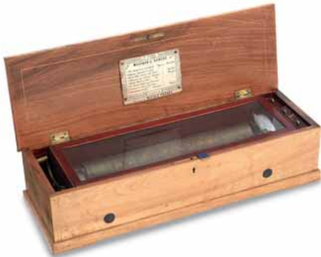
454 A 19TH CENTURY WALNUT AND MARQUETRY INLAID CYLINDER MUSIC BOX Inscribed Nicole Freres, 40603 With 32cm cylinder playing eight airs, as per paper label, contained within a rectangular case, 54cm wide, 18cm deep, 13cm high (21 in wide, 7 in deep, 5 in high) £600 - 900 €660 - 980