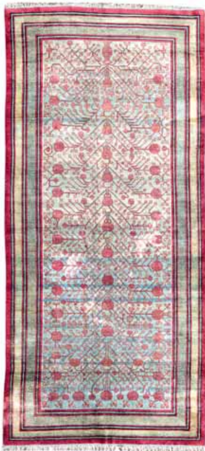
418 A CHINESE CARPET 157cm x 360cm £400 - 600 €440 - 660