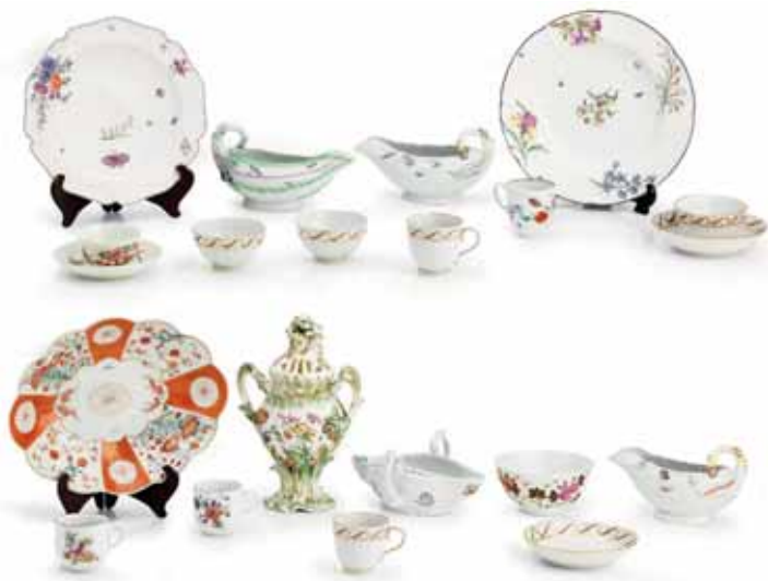
64 A GROUP OF WORCESTER AND OTHER ENGLISH PORCELAIN 18th and 19th Century Including three cos lettuce sauceboats, a two-handled sauceboat, an 'Astley' pattern coffee cup, a 'Scarlet Japan' oval scalloped dish, 27.5cm, a teabowl and saucer and a small bowl, a Coalport vase and cover, 25cm, and various other pieces (qty) £600 - 800 €660 - 870