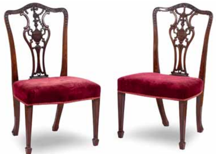
285 A SET OF EIGHT LATE 19TH/EARLY 20TH CENTURY MAHOGANY DINING CHAIRS, IN THE 18TH CENTURY MANNER

Each with pierced and carved splat centred with an urn and trailing garlands, above a stuff over seat raised on square legs with spade feet, 59cm wide, 50cm deep, 102cm high (23in wide, 19 1/2in deep, 40in high).