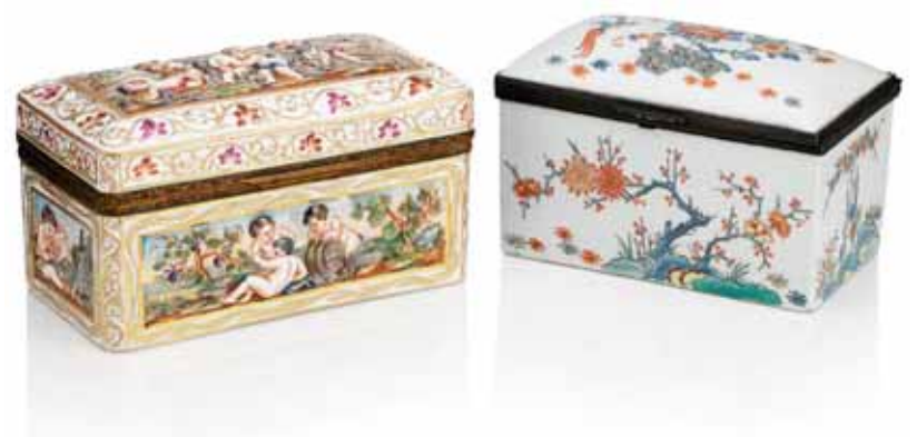
69 A CAPODIMONTE STYLE CASKET Late 19th Century Moulded in shallow relief with cherubs within panels, underglaze blue crowned N mark, 20.5cm wide, together with a Chantilly style casket, probably Samson, the domed cover and sides painted with Kakiemon style foliate designs, 18.5cm wide (2) £500 - 700 €550 - 760