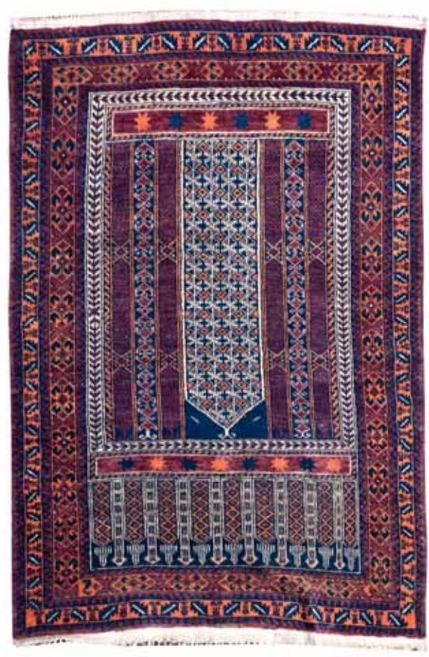
416 A GROUP OF THREE BELOUCH RUGS 125cm x 84cm, 184cm x 120cm, 187cm x 100cm (3) £300 - 500 €330 - 550