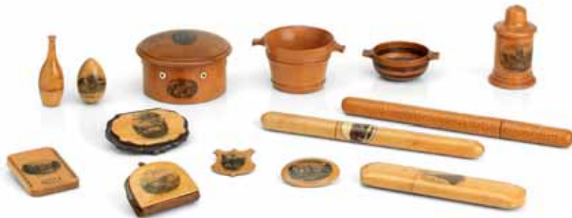
302 A COLLECTION OF 19TH CENTURY MAUCHLINE WARE Comprising a wide range of objects, including letter openers, purses, badges, pin cushions and knitting needle cases, together with many souvenirs with transfer scenes of Scotland such as Blair Castle, Dunkeld, The Wallace Monument and Stirling Castle, (qty) £250 - 350 €270 - 380