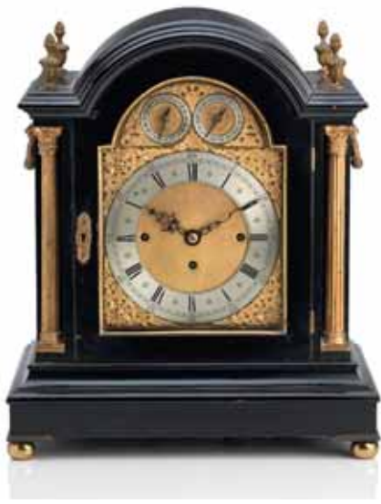
438 A LATE 19TH CENTURY EBONIZED AND GILT METAL MOUNTED BRACKET CLOCK The 7 1/2 in. dial with Roman numerals, subsidiary chime/silent and chime on eight bells/ Westminster chimes dials, the triple chain drive fusee movement striking on an array of gongs and bells, 43cm wide, 28cm deep, 47cm high, (16 1/2in wide, 11in deep, 18 1/2in high) £1,000 - 1,500 €1,100 - 1,600