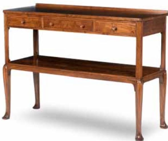
272 A MID 20TH CENTURY WALNUT TWO TIER BUFFET stamped Whytock & Reid, Edinburgh, The rectangular top with back board above three drawers, raised on cabriole legs with pointed toes, joined by an undertier, 117cm wide, 45cm deep, 85cm high (46in wide, 17 1/2in deep, 33in high). £400 - 600 €440 - 660