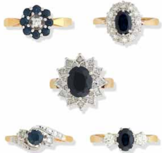
481 A COLLECTION OF GEM-SET AND DIAMOND RINGS Comprising: three of cluster design and two of three-stone design, most set with sapphires and diamonds, sizes K, M, O, M, N; most stamped for 18 carat gold (5) £400 - 600 €440 - 660