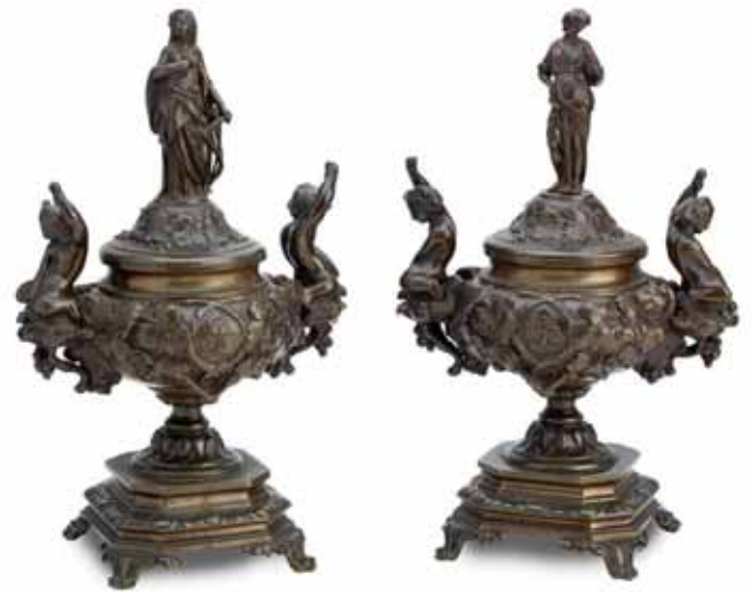
301 A PAIR OF FRENCH LATE 19TH CENTURY BRONZE PEDESTAL URNS WITH COVERS with all over vine leaf decoration, figural finials to covers and putti handles to either side, 55cm wide, 34cm deep, 34cm high (22in wide, 13.5in deep, 13in high) (2) £600 - 800 €660 - 870

See https://www.bonhams.com/ for further footnote on this lot