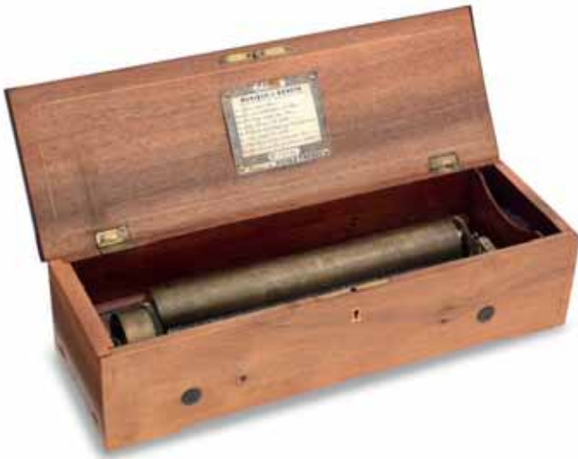
460 A 19TH CENTURY WALNUT AND MARQUETRY INLAID CYLINDER MUSIC BOX Stamped Nicole Freres, No.28260 With 33cm cylinder playing eight airs, as per paper label, contained within a rectangular case, 52cm wide, 18cm deep, 13cm high (20in wide, 7in deep, 5in high) £600 - 900 €660 - 980