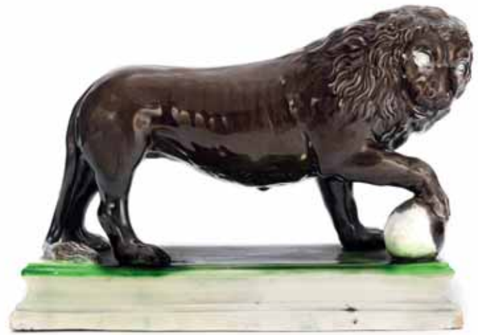
59 A LARGE WOOD FAMILY MODEL OF A LION Circa 1780-90 Standing upon a rectangular base washed in green on the upper surface, its paw resting on a ball, its body washed in dark grey save for the eyes, base 28cm wide £400 - 600 €440 - 660

See https://www.bonhams.com/ for further footnote on this lot