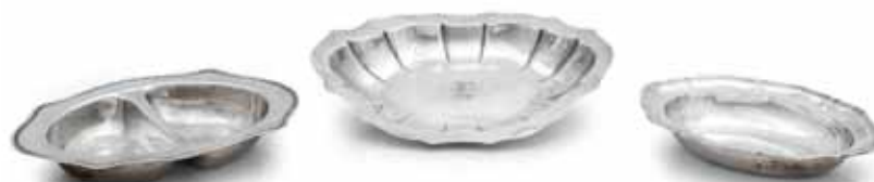
142 AN AMERICAN SILVER BREAD DISH AND THREE VEGETABLE DISHES the bread dish by International Silver Company Of fluted form with engraved initial, the double section dish by Gorham , and pair of dishes by Hardy & Hayes , weight 49oz. (4) £500 - 700 €550 - 760