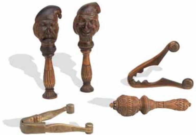
377 A COLLECTION OF FIVE 19TH CENTURY CARVED WOODEN NUTCRACKERS Comprising two wishbone style examples dated 1879 and 1877, a turned and incised example and two similar examples carved with character portraits possibly depicting characters from Burns, the character examples each, 5cm wide, 7cm deep, 20cm high (1 1/2in wide, 2 1/2in deep, 7 1/2in high) (5) £400 - 600 €440 - 660