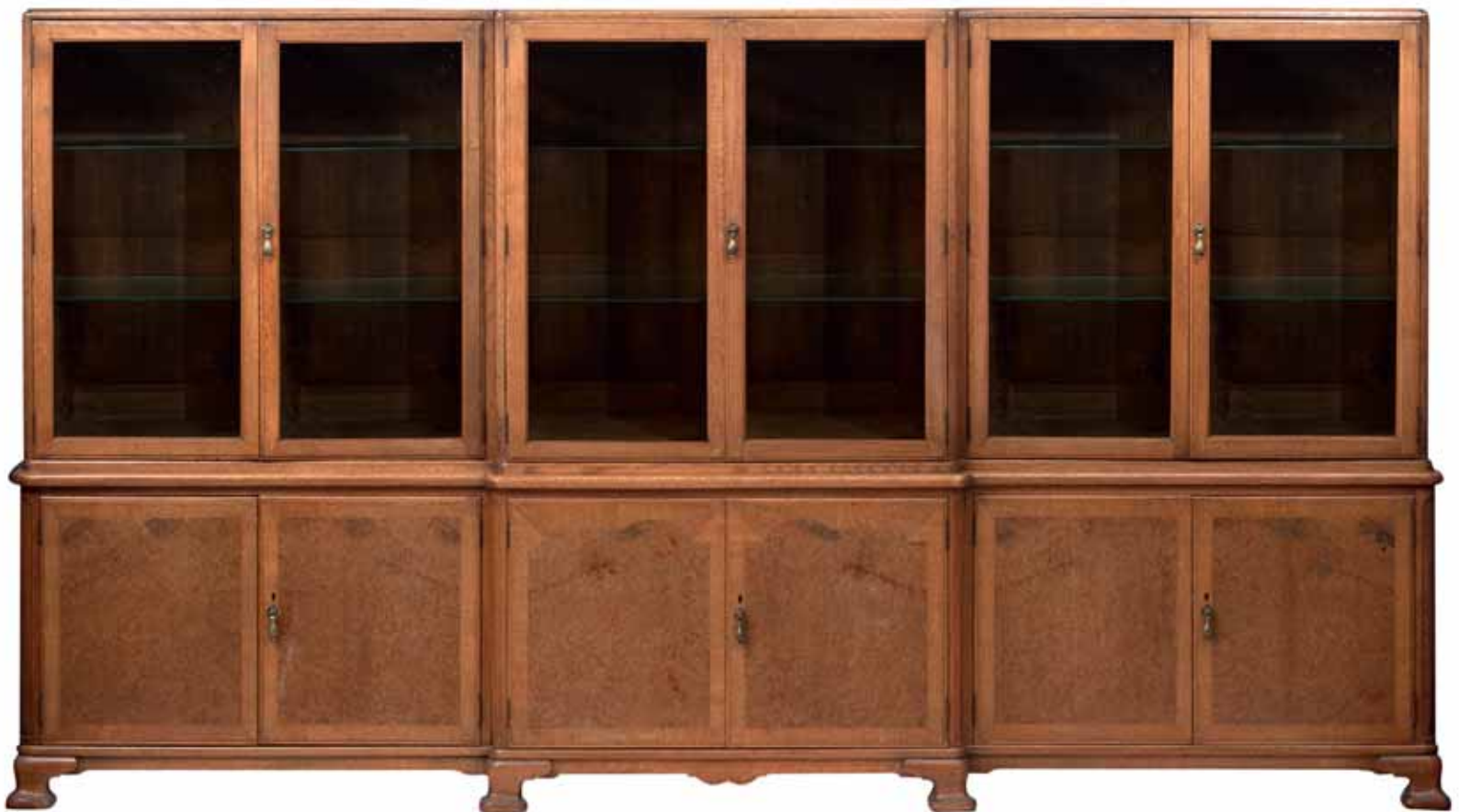
373 A MID 20TH CENTURY OAK AND WALNUT BREAKFRONT BOOKCASE in the Chinese Chippendale style, probably by Whytock & Reid, Edinburgh, The upper section fitted with three pairs of glazed doors enclosing adjustable glass shelves, the base fitted with three pairs of cupboard doors, raised on squat cabriole legs with pointed toes, 294cm wide, 37cm deep, 141cm high (115 1/2in wide, 14 1/2in deep, 55 1/2in high). £1,000 - 1,500 €1,100 - 1,600

See https://www.bonhams.com/ for further footnote on this lot