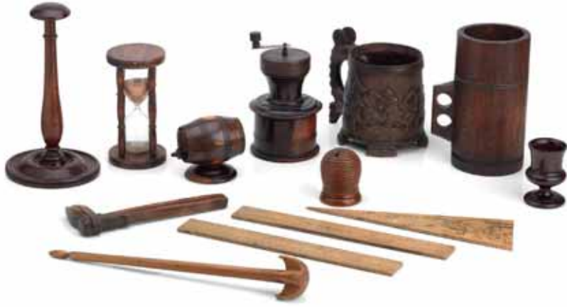
300 A COLLECTION OF VARIOUS 19TH CENTURY TREEN WARES (For full description please visit www.bonhams.com ) £700 - 900 €760 - 980

See https://www.bonhams.com/ for further footnote on this lot