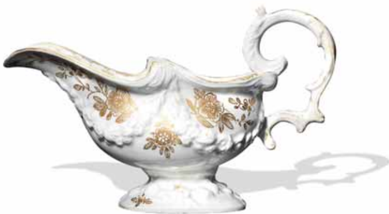
62 A GOOD BOW SAUCEBOAT Circa 1750 Of high-footed form, crisply moulded with swags of fruit and flowers suspended from the scrolled rim, more swags around the oval foot, the high double-scrolled handle with an acanthus thumbrest, gilded inside and out with flower sprays and scattered insects, a formal border inside the rim, 22.3cm long £500 - 700 €550 - 760

See https://www.bonhams.com/ for further footnote on this lot