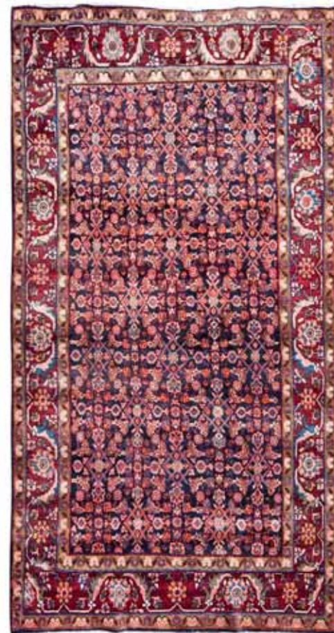
423 A MALAYER RUNNER 300cm x 160cm £300 - 500 €330 - 550

See https://www.bonhams.com/ for further footnote on this lot