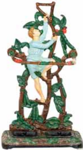
376 A 19TH CENTURY CAST IRON “JACK AND THE BEANSTALK” STICK STAND Cast to the rear 'RN72233', poly chrome decorated with two removable drip trays, 50cm wide, 26cm deep, 85cm high (19 1/2in wide, 10in deep, 33in high) £300 €330