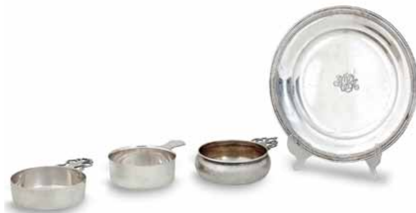
140 TIFFANY & CO; FOUR ITEMS OF SILVERWARE marked Tiffany & Co., Sterling Silver To include a circular plate, a rectangular bowl and two christening bowls in the form of wine tasters, and two further christening bowls, weight 58oz. (6) £500 - 700 €550 - 760