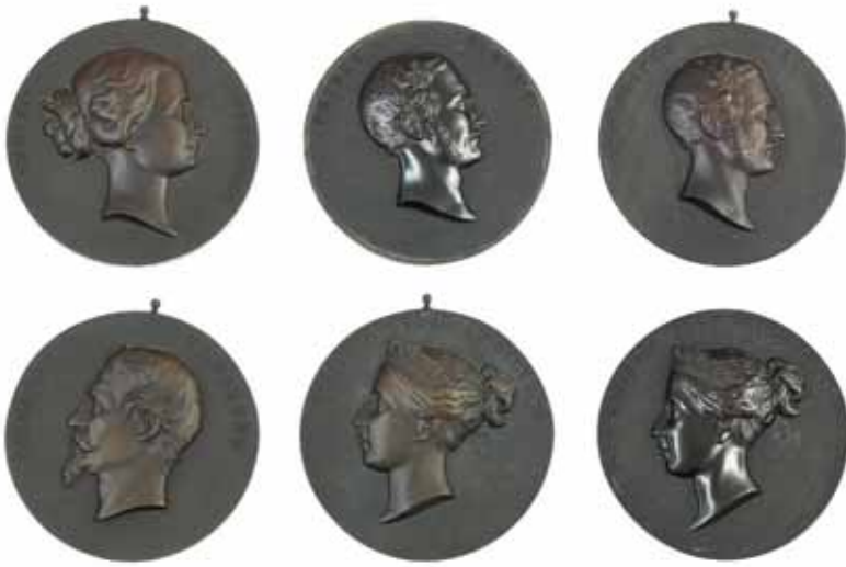
268 A GROUP OF SIX MID 19TH CENTURY BOIS DURCI PORTRAIT MEDALLIONS Four depicting Eugenie, Napoleon III, Prince Albert and Queen Victoria, 11cm diameter; and another two of Prince Albert and Queen Victoria, each 2cm deep, 11cm in diameter (1/2in deep, 4in in diameter). (6) £100 - 150 €110 - 160