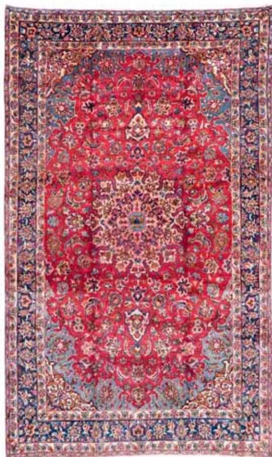
403 A KASHAN RUG 350cm x 250cm £300 - 500 €330 - 550