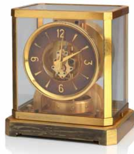
443 A JAEGER LE COULTRE ATMOS CLOCK The 4 1/2in dial with Arabic and baton numerals, serial No. 61527, gilt brass case with outer case, 21cm wide, 16cm deep, 24cm high (7 1/2in wide, 5 1/2in deep, 9in high) £250 - 350 €270 - 380