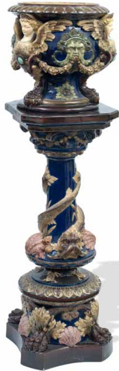
75 A CONTINENTAL MAJOLICA JARDINIERE AND STAND Circa 1900 The pedestal modelled with fish, shells, toads and stylised foliage, the bowl with mask heads and winged sirens, 140cm high (2) £800 - 1,000 €870 - 1,100